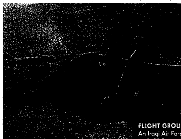
FLIGHT GROUNDED An Iraqi Air Force MiG-25 Foxbat-B fighter jet buried in the sands of the al-Taqqadum airfield, west of Baghdad, on July 6, 2003.