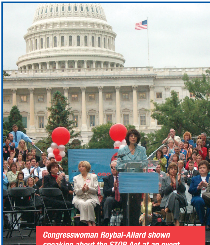
Congresswoman Roybal-Allard shown speaking about the STOP Act at an event marking the 25th anniversary of Mothers Against Drunk Driving.

A leading congressional advocate in the fight against underage drinking, the congresswoman won a major victory with the passage of her bill, The Sober Truth On Preventing Underage Drinking Act, in the U.S. House and Senate. The STOP Act is the first comprehensive national legislation to address this public health crisis. According to the Institute of Medicine, during any given month in our country, nearly 11 million youth between the ages of 12 and 20 drink alcohol. Based on the Institute's recommendations to reduce underage drinking, the STOP Act: formally establishes an interagency committee to coordinate all federal underage drinking programs and research initiatives; makes permanent an Ad Council national media campaign directed at parents; provides grants to colleges and local communities to combat the problem; and authorizes federal funding for crucial research on its health effects on young people. For her efforts in Congress, the congresswoman has been nationally honored by MADD, the Community Anti-Drug Coalitions of America and Students Against Destructive Decisions.