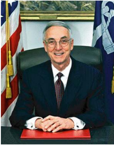
The Honorable Gordon R. England

The Secretary of the Navy entrusts the leadership of the Chaplain Corps to the Chief of Chaplains. The Chief of Chaplains, in turn, exercises this leadership to orient and direct the Chaplain Corps to fulfill its responsibilities to the men and women of the Sea Services.