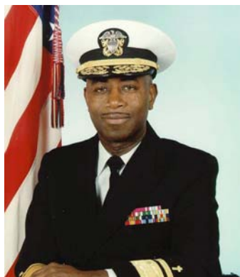
Barry C. Black RADM, CHC, USN Chief of Chaplains/Director Religious Ministry Support