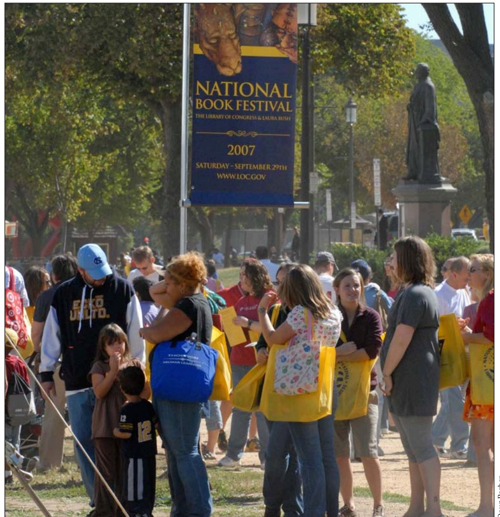
Waiting in lines is one order of the day at the National Book Festival. Lines formed for book-signings, picture-posing, book sales, give-aways, food and water.