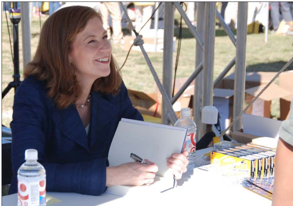
Jan Crawford Greenburg signs her new book about the Supreme Court.

Justice O'Connor went to her closest friend on the court, Chief Justice Rehnquist, in 2004 and told him that she was thinking of retiring, according to Greenburg. Ill at the time, Rehnquist said that they didn't need two vacancies on the court at the same time. He later told her he had decided to continue in office, and O'Connor reluctantly agreed to step down then, rather than wait for another two years. However, the chief justice