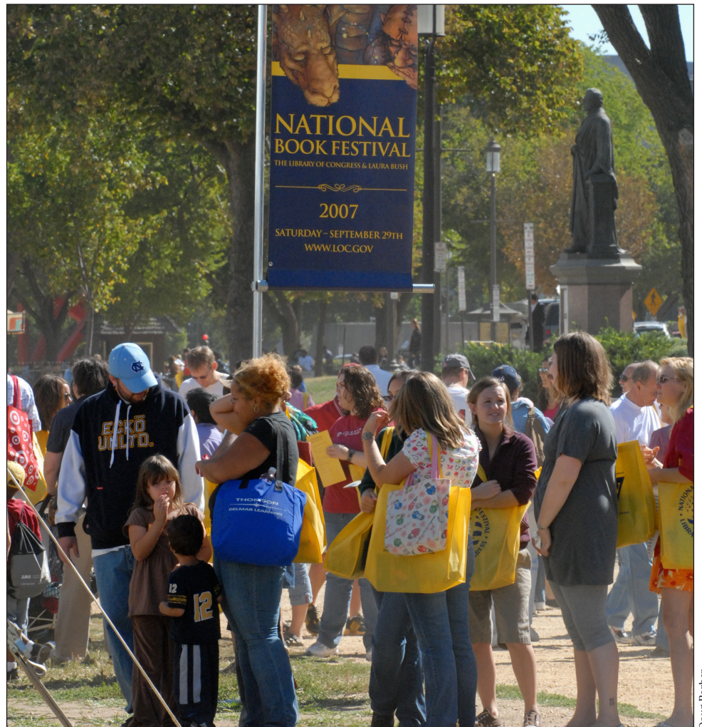
Waiting in lines is one order of the day at the National Book Festival. Lines formed for book-signings, picture-posing, book sales, give-aways, food and water.