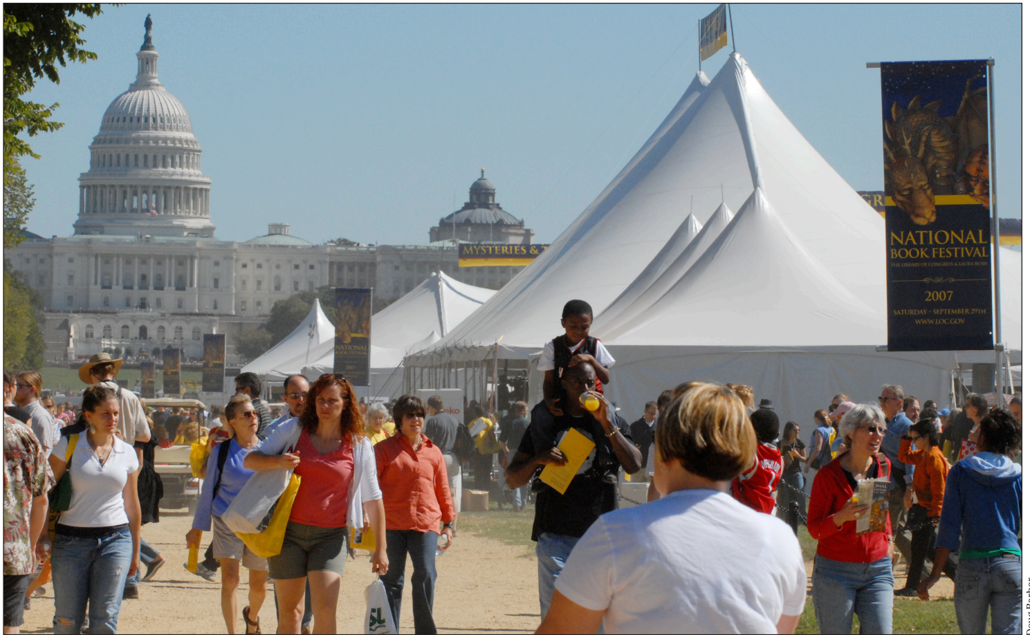
More than 120,000 readers gather at the National Book Festival to laugh, cry and learn with their favorite writers.