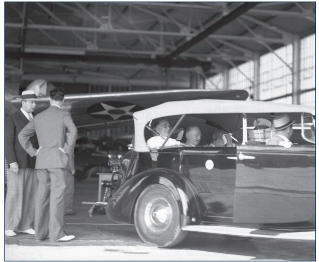
President Roosevelt visits Langley on 29 July 1940.