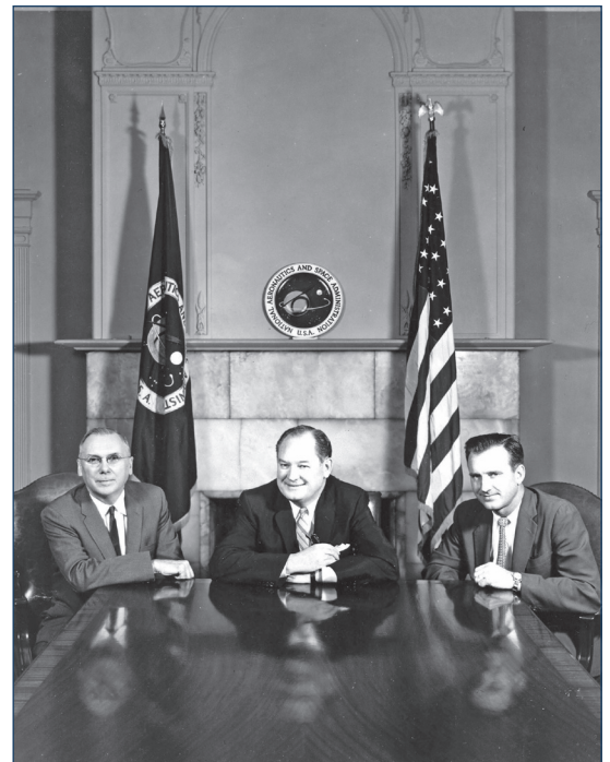
NASA's top management from 1958 to 1960 consisted of T. Keith Glennan, Administrator (center); Hugh L. Dryden, Deputy Administrator (left); and Richard E. Horner, Associate Administrator (right). This photo, dated 1 March 1960 and probably taken at NASA's first Headquarters at the Dolly Madison House, also shows the new seal of NASA on the wall above Glennan.

The Space Act has been amended many times since 1958 (see online reference below for details), but these goals have changed little. In NASA's Authorization Act for 1985, the expansion of human knowledge "of the Earth" was added to goal 1, reflecting increased concern about Earth resources and global climate change. In the Authorization Act for 1989, a ninth goal was added: "The preservation of the United States preeminent position in aeronautics and space through research and technology development related to associated manufacturing processes." Other sections of the Space Act dealt with civilian-military coordination, international cooperation, the demise of the NACA, the transfer of functions from other government agencies, and intellectual property rights.