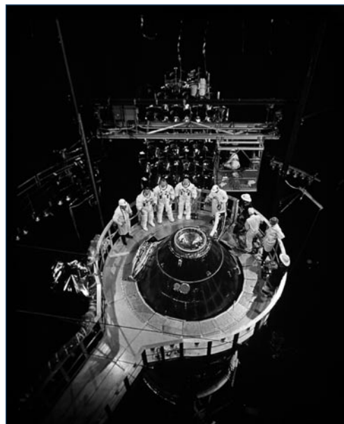
High-angle interior view of Chamber A showing three astronauts preparing to enter the Block II Thermal Vacuum Test Article in 1969. (Image Number S68-37430)

Compliance with the National Historic Preservation Act (NHPA) is required when projects, called