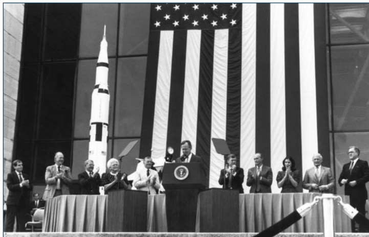
President George H. W. Bush announces his Space Exploration Initiative plan on 20 July 1989, the 20th anniversary of the Apollo 11 lunar landing. (Image Number 89-H-380)