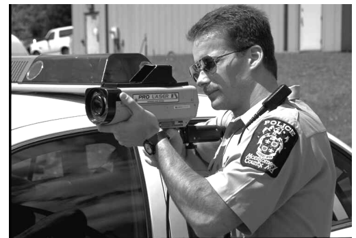
Law enforcement officer using a traditional down-the-road radar gun during speed enforcement operations.

Across-the-road Doppler radar systems are being increasingly used by law enforcement authorities for measuring vehicle speeds on the nation's highways. These systems differ from older, down-the-road radar guns that are aligned with the direction of motion of the moving target vehicle, to obtain a more accurate reading of vehicle speed.