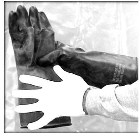
Samples of protective gloves.

The objective of this project is to provide technical support to NLECTC at Rockville, Maryland in their testing program for protective gloves for law enforcement and corrections users.