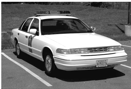
Purchasing of police vehicles is aided by AutoBid.

A microcomputer system called AutoBid was developed to help police fleet managers select patrol vehicles best suited to their needs. The system is based on vehicle performance data for police patrol models published annually by the Michigan State Police and NIJ. AutoBid currently runs only on the DOS platform in character mode and has no graphical, windows-like features. An updated version of AutoBid with a modern, graphical interface is needed for all computer platforms.