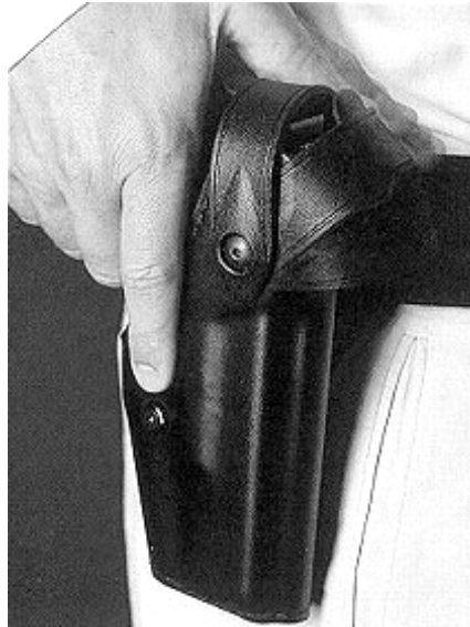
Holster retention systems for law enforcement officers have saved lives.

The advancement in holster design has been unprecedented in recent years, and the development and use of "security" type holsters may well be a factor in the general reduction in the number of officers killed by their own guns in the past several years. Manufacturers have developed a preliminary ranking system, which designates holsters as Level I, II, or III retention holsters. This ranking effectively evaluates the difficulty encountered by someone, other than the officer, in removing the gun from the holster. There is also an increased difficulty for the officer to draw his gun as the retention level increases, resulting in the need for an increased amount of training and practice to become proficient. To standardize the definitions of retention, NIJ has indicated a need for an NIJ Standard for Law Enforcement Holsters.