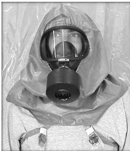
A typical protective mask for first responders, law enforcement officers, corrections officers, and EMS providers.

The objective is to develop National Institute of Occupational Safety and Health (NIOSH) approved respiratory protection equipment against terrorism agents for emergency first responders and public safety workers.