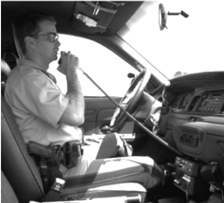
The ability of an officer to communicate with other local agencies and emergency responders is critical to efficient and safe operations.

assist the federal, state, and local criminal justice and public safety communities in achieving their interoperability technology needs.