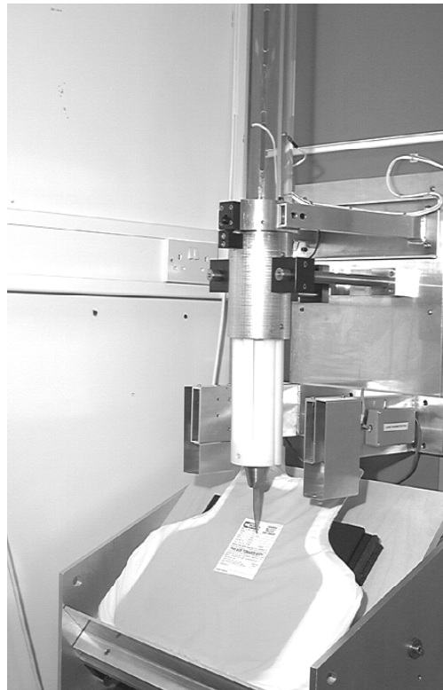
OLES stab test apparatus used to support development of NIJ body armor standard for stab resistance.

The objective of this project is to provide continuing support to the stab resistant body armor compliance testing program. NIJ Standard–0115.00 is the first true U.S. standard addressing the stab resistance of personal body armor, and it provides a consistent measure by which stab resistant body armor performance can be assessed. The stab threat from sharp and edged weapons represents the primary threat to corrections officers and a secondary threat to police officers in the United States. Many agencies are expected to take advantage of the matching funds offered through the Bulletproof Vest Partnership Act Program and to purchase stab resistant body armor certified to this standard.