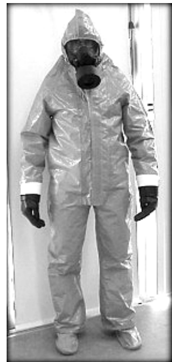
A chemical/biological protective suit

The objective is to develop standards for personal protection equipment (including suits, boots, gloves, etc.), detection equipment, and decontamination equipment for chemical and biological agents for emergency first responders and public safety workers.