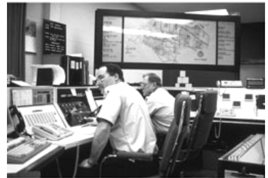
Effective communication is a critical aspect of both law enforcement and corrections operations. Dispatch is the nerve center of the agency.

community. There are more than 17000 law enforcement agencies in the United States. Approximately 95 % of these agencies employ fewer than 100 sworn officers. Additionally, over 35000 fire and emergency medical agencies exist across the nation. Due to the fragmented nature of this community, most public safety communications systems are stovepipe systems that do not facilitate interoperability. To further complicate the situation, public safety radio frequencies are distributed across four isolated frequency bands from low band VHF (25 MHz to 50 MHz) to 800 MHz (806 MHz to 869 MHz), with no universally available or affordable radio being able to operate across the entire range.