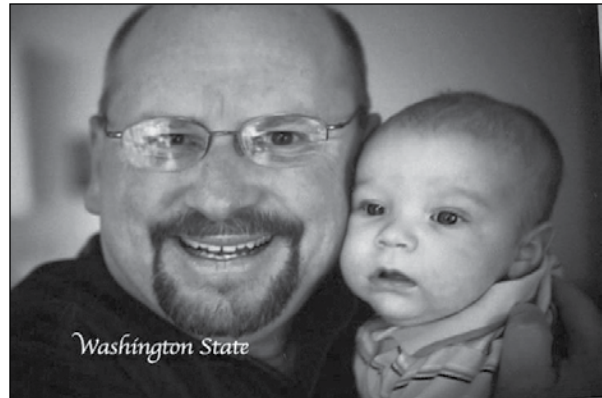
A freeze-frame image from Washington’s “compelling” video shows a noncustodial father meeting with his grandson for the first time.