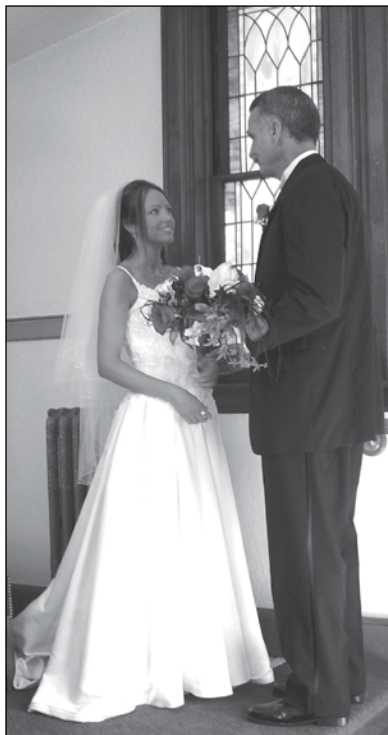
Volunteer actors and donated props in this wedding scene helped to cut costs for Utah’s public service announcements.

To capture the audience’s attention, the commercials portray fun and memorable experi-