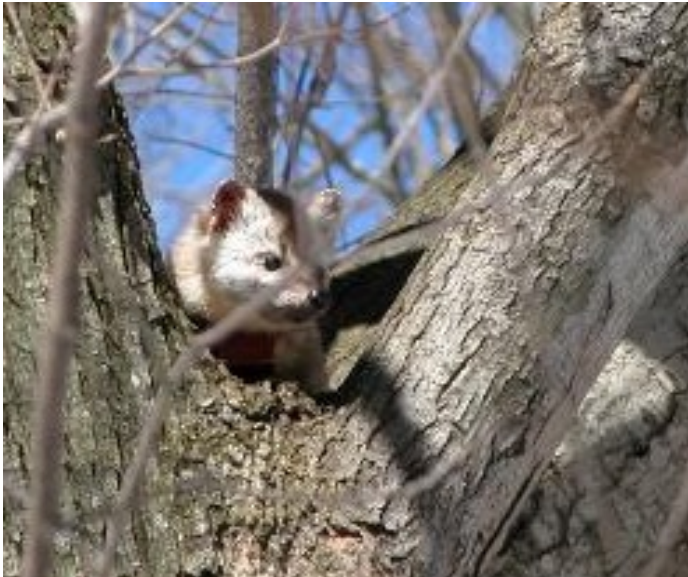
Pictures 8 and 9: Female American marten caught in capture study in Michigan - included here for information only.