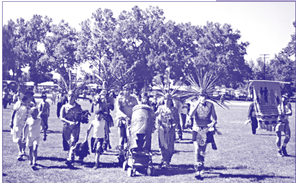
United Farm Workers March, Sunday June 4, 2000, Pasco, WA. "Mexican Indians." Pasco PD estimates 4,000 marchers.

At the request of the Minority Community Police Relations Task Force, CRS deployed personnel to Anchorage, Alaska, on August 10, 2000, to address racial problems stemming from the influx of Latinos and other immigrants. CRS worked with the chief of police, the executive director of the Anchorage Equal Rights Commission, and representatives of minority communities to address police-community tensions and access to the justice system for non-English speaking communities. CRS provided Spanish, Vietnamese, and English versions of pamphlets addressing police-community relations and cosponsored a program for police on minority hiring and recruitment. CRS also worked with the parties to develop a collaborative approach whereby police and minority communities work collectively to resolve racial conflicts.