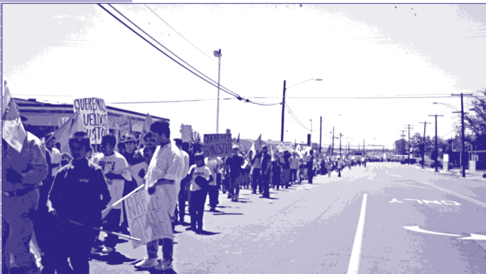
United Farm Workers March, Sunday June 4, 2000, Pasco, WA. "Rally after the march." Pasco PD estimates 4,000 marchers.