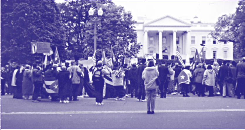
Protest at the White House regarding U.S. Government policy on the return of Elian Gonzales.