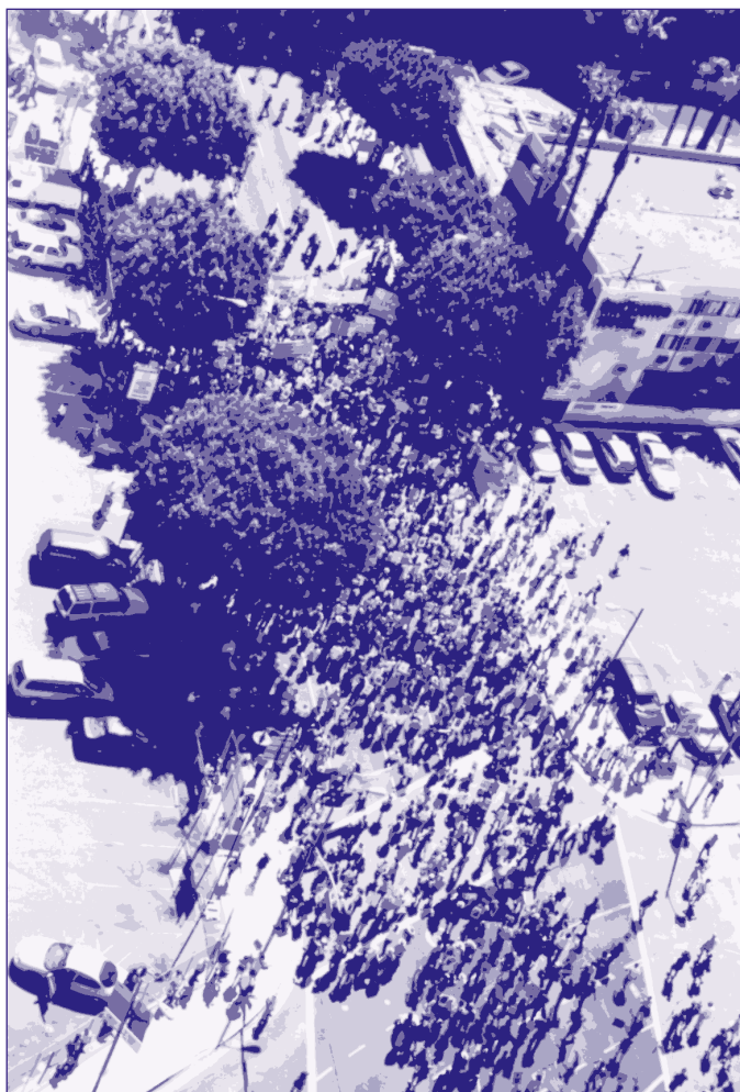
An aerial view of a major protest during the Democratic National Convention in Los Angeles, CA.

Four months before the political conventions, the CRS Mid-Atlantic and Western regional offices began participating in multi-agency planning meetings with the U.S. Attorneys' Offices, the Special Events Division of the FBI, local officials, and the local police departments in Los Angeles for the DNC and in Philadelphia for the RNC. During the conventions, CRS was represented at the Multi-Agency Communication Centers (MACC) and established strong working relationships with law enforcement, human relations agencies, and protest leaders. CRS positioned itself as the first point of contact for conflict situations.