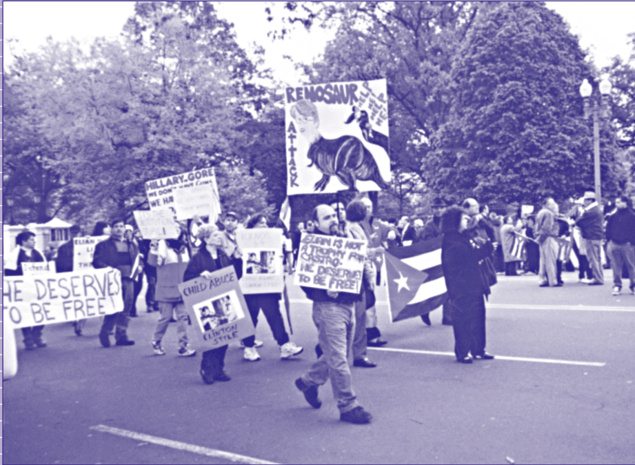
Cuban Americans protesting U.S. Government position regarding the return of Elian Gonzales to Cuba.

Elian Gonzales and Cuban Americans Miami, Florida