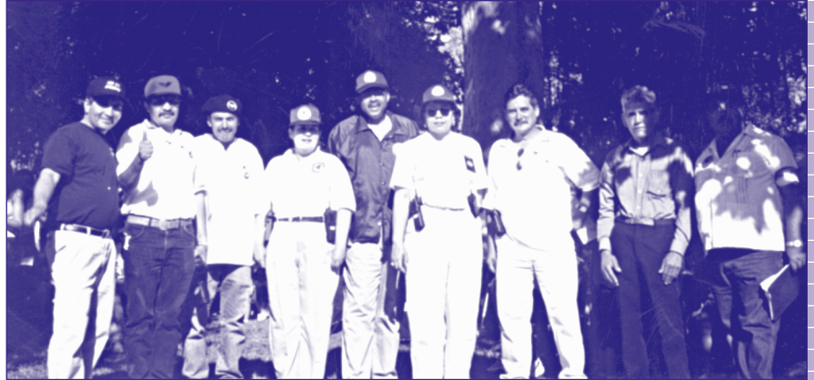
United Farm Workers March, Sunday June 4, 2000, Pasco, WA. "CRS staff and march organizers." Pasco PD estimates 4,000 marchers.

of a parade permit and assisted police and event organizers in intensive self-marshal training to help ensure an orderly march. CRS also facilitated communication and resolved differences between police and protesters during the march on June 4, in which about 4,000 people participated. CRS services contributed to the preservation of order and the prevention of violence during the event.