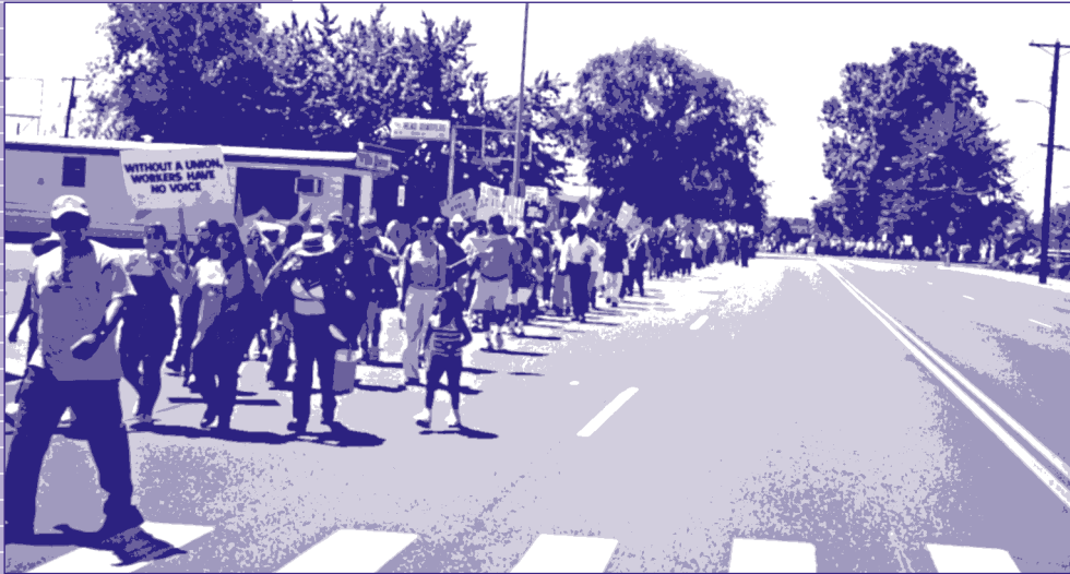
United Farm Workers March, Sunday June 4, 2000, Pasco, WA. "Rally after the march." Pasco PD estimates 4,000 marchers.