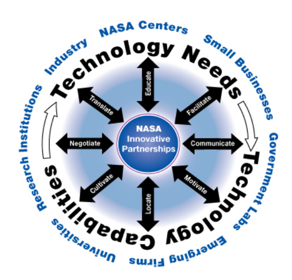
Figure 1. NASA's Innovative Partnerships Program is engaged in a dynamic process to match technology needs with capabilities.

IPP also seeks solutions to some of NASA's pressing technical challenges by funding Small Business Innovation Research and Small Business Technology Transfer projects; seeking cost-shared, technology development partnerships through the IPP Seed Fund; and tapping into new sources of innovation through NASA's Centennial Challenges prize program. IPP seeks to facilitate and catalyze innovative partnerships in two directions: technology infusion to provide technical solutions to some of the challenges being faced by NASA's programs and projects; and technology transfer-or spinoffs-to provide solutions to technical challenges in the private sector or other Government agencies with NASAdeveloped technology. In short, IPP is seeking to match technology needs with technology capabilities<sup>2</sup>, as illustrated in Figure 1. IPP achieves these objectives through a nationwide network of offices across NASA's 10 field centers.