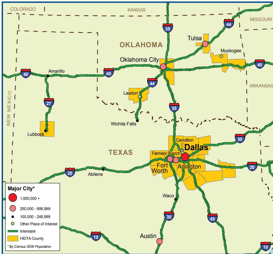
Figure 2. North Texas HIDTA transportation infrastructure.

point for illicit drugs transported to other U.S. drug markets, including those in Arkansas, Florida, Georgia, Illinois, Kentucky, Louisiana, Michigan, Missouri, North Carolina, Ohio, and Tennessee.