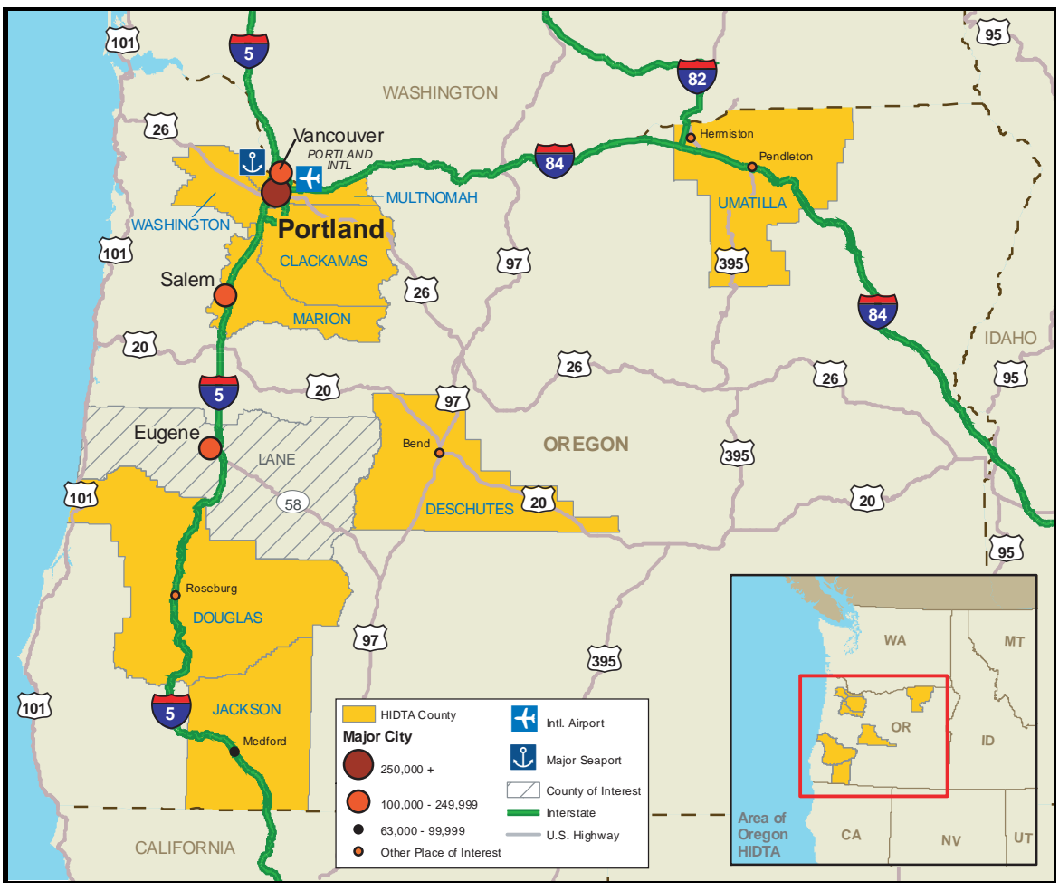
Figure 1. Oregon High Intensity Drug Trafficking Area and transportation infrastructure.

recent law enforcement reporting, information obtained through interviews with law enforcement and public health officials, and available statistical data. The report is designed to provide policy makers, resource planners, and law enforcement officials with a focused discussion of key drug issues and developments facing the Oregon HIDTA region.