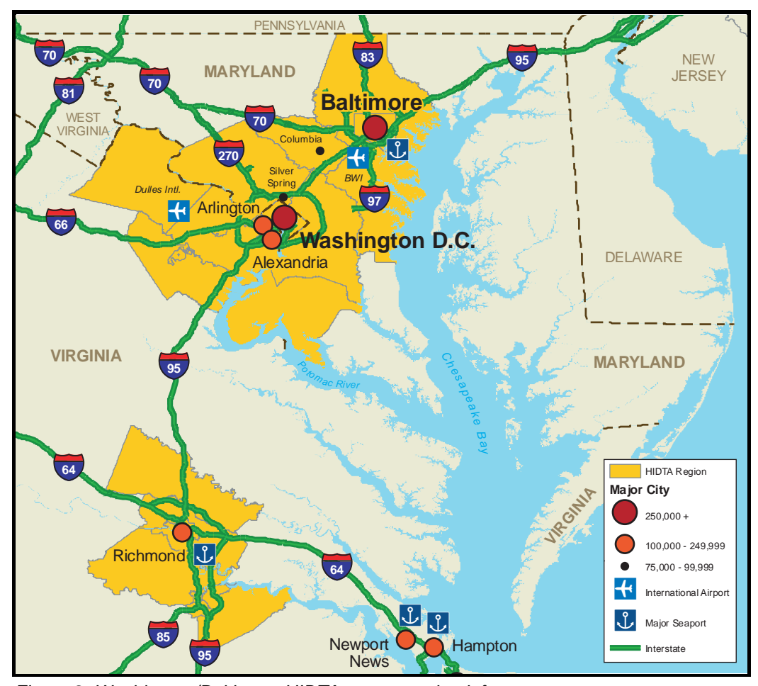
Figure 2. Washington/Baltimore HIDTA transportation infrastructure.

hiding them in ceramic statues, candles, bubble bath containers, coffee cans, drink bottles, blenders, cooking pots, VCRs, or computer hard drives.