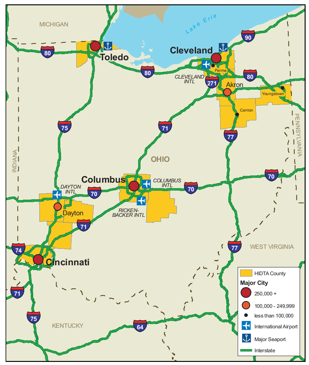
Figure 2. Ohio HIDTA region transportation infrastructure.