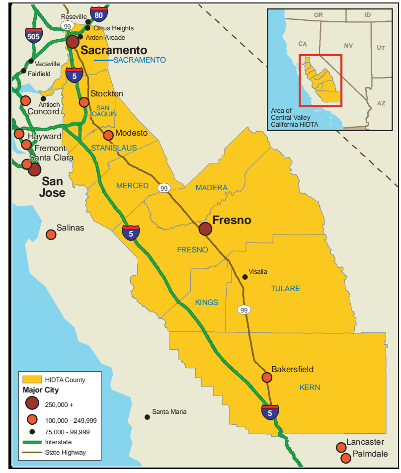
Figure 1. Central Valley High Intensity Drug Trafficking Area.

reporting, information obtained through interviews with law enforcement and public health officials, and available statistical data. The report is designed to provide policymakers, resource planners, and law enforcement officials with a focused discussion of key drug issues and developments facing the Central Valley California HIDTA.