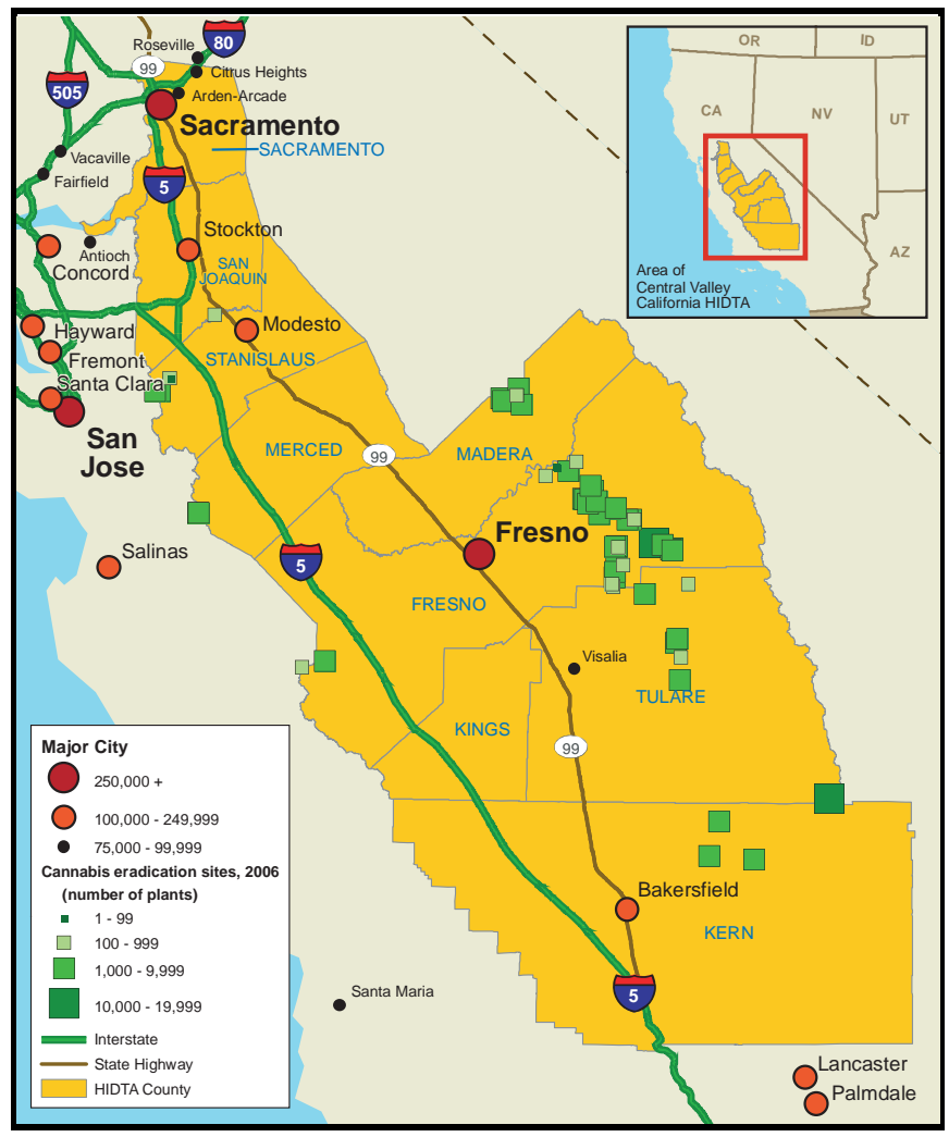
Figure 2. Central Valley California HIDTA cannabis eradication sites, 2006.

Asian criminal groups in the region often operate several sites simultaneously, working in coordination with associates in cities within and outside the region to facilitate growing operations. Some groups establish grow sites in several areas in an attempt to decrease losses from law enforcement eradication efforts. These groups manage their grow sites independently; however, they often exchange supplies, share grow methods, and coordinate smuggling efforts. For instance, law enforcement reporting indicates that several of the large indoor grow sites seized in the CVC HIDTA during 2006 were connected with similar grow sites seized in the San Francisco area as well as with grow sites seized in western Canada.