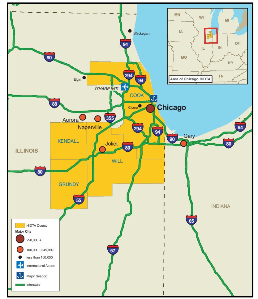
Figure 1. Chicago High Intensity Drug Trafficking Area.

recent law enforcement reporting, information obtained through interviews with law enforcement and public health officials, and available statistical data. The report is designed to provide policymakers, resource planners, and law enforcement officials with a focused discussion of key drug issues and developments facing the Chicago HIDTA.