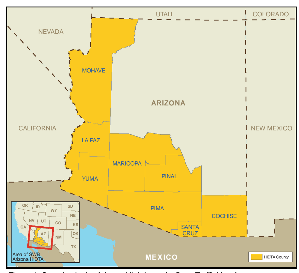
Figure 1. Counties in the Arizona High Intensity Drug Trafficking Area.

reporting, information obtained through interviews with law enforcement and public health officials, and available statistical data. The report is designed to provide policymakers, resource planners, and law enforcement officials with a focused discussion of key drug issues and developments facing the Arizona HIDTA.