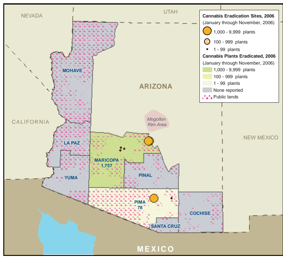
Figure 2. Cannabis eradication sites in the Arizona HIDTA region, 2006.

being smuggled from Mexico to Arizona, where it was going to be separated, mixed with hydrogen chloride (HCl), "bubbled," and then crystallized into ice methamphetamine. This smuggling technique is increasingly used by Mexican traffickers, who take extra precautions to avoid law enforcement interdiction, particularly during production.