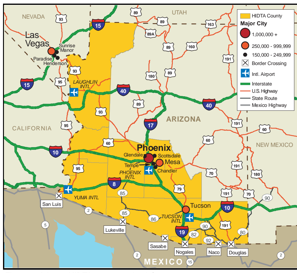
Figure 3. Arizona HIDTA transportation infrastructure.

smaller loads (20 to 100 kg) than they had transported previously, particularly when smuggling cocaine, most likely to cut their losses in the event of law enforcement interdiction. Smaller drug loads typically are stored in stash houses in the Nogales area for consolidation and eventual bulk transport to Tucson and Phoenix. Once in Tucson and Phoenix, some of the drugs are distributed locally; however, significant quantities are repackaged and shipped to other U.S. destinations, including Colorado, Georgia, Indiana, Kansas, Kentucky, Missouri, Nebraska, Ohio, Utah, and Wisconsin. Most drug proceeds are transported in the reverse direction, often in the same vehicles used to transport illicit drugs to the area.