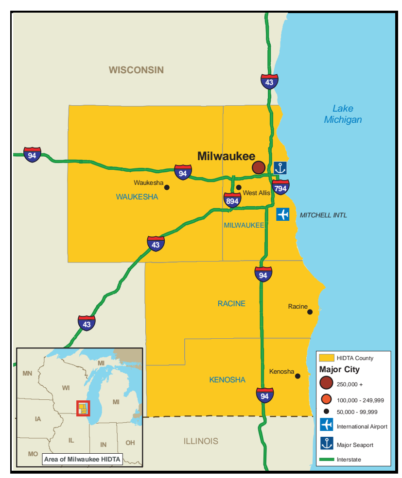
Figure 1. Milwaukee High Intensity Drug Trafficking Area.

reporting, information obtained through interviews with law enforcement and public health officials, and available statistical data. The report is designed to provide policymakers, resource planners, and law enforcement officials with a focused discussion of key drug issues and developments facing the Milwaukee HIDTA.