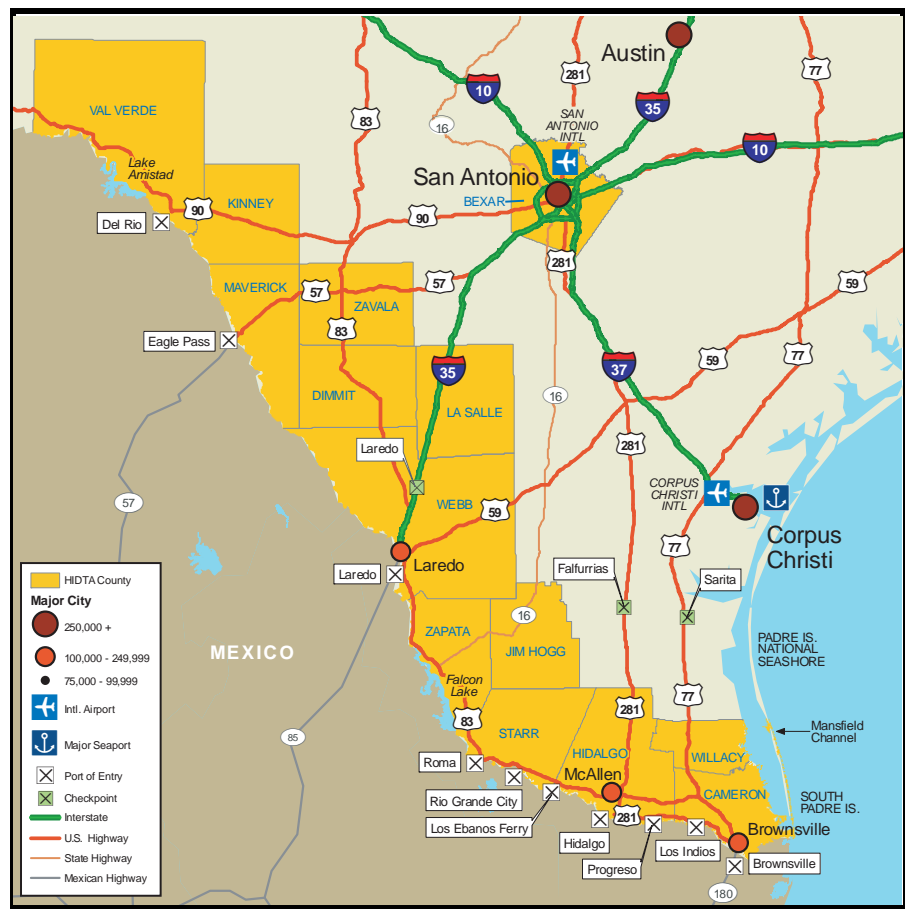
Figure 2. South Texas HIDTA region transportation infrastructure.

South Texas. Traffickers easily traverse the Rio Grande River, which demarcates the border and which, in many locations, can be crossed on foot, in boats, or by vehicle. After shipments are smuggled across the river, they are generally loaded into waiting vehicles for transport to a stash location or concealed in vegetation until they can be retrieved. However, traffickers try to avoid stashing drug shipments along the river; doing so leaves the drugs vulnerable to theft by other DTOs or seizure by law enforcement officers.