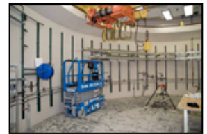
Conduit and cable trays are installed in the Round Room at the Criticality Experiments Facility.