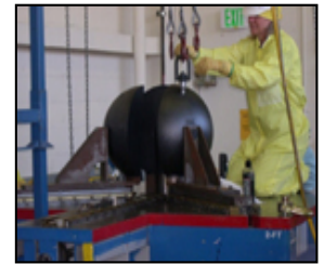
A worker works on flattop reflectors in the Criticality Experiments Facility.