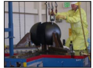
A worker works on flattop reflectors in the Criticality Experiments Facility.

Later this year, the machines will be packaged up and sent to the DAF for installation and a rigorous start-up process. Once approved for operation, these machines will perform valuable experiments vital to national security.