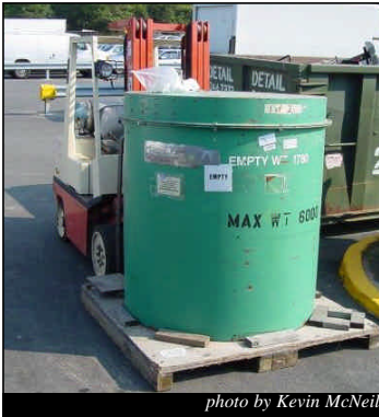
An overpack container is used to transport the sealed source unit to its final destination.

The first source was recovered from Patchogue Medford High School in Medford, New York August 24, 2004. A second source was recovered from Parsippany Hills High School in Morris Plains, New Jersey August 25, 2004. These sources, which contained Cesium-137, were distributed during the Atoms for Peace Program of the 1960s for scholastic research and study. They were identified by NNSA to be of interest to national security because this type of source is considered especially suitable for use in a Radiological Dispersal Device (RDD), otherwise known as a "dirty bomb."