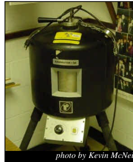
An example of a Gammator Irradiator unit recovered during the operation.