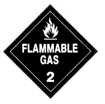
(b) In addition to complying with $172.519, the background color on the

(a) Except for size and color, the FLAMMABLE GAS placard must be as follows: