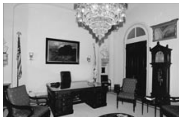
The vice president's Capitol office

As president of the Senate, many early vice presidents took an active role in Chamber proceedings—presiding over debates and interpreting parliamentary questions. In response, the Senate developed rules and practices to affirm its independence from this representative of the executive branch. Nevertheless, the vice president has continued over the years to serve as a bridge between the administration and the Senate, and still maintains an office in the Capitol for that reason.