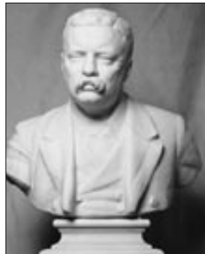
Theodore Roosevelt (1858–1919) 25 James Earle Fraser, 1910

Sculptor Augustus Saint-Gaudens originally declined to create Arthur's official vice presidential bust, citing his own schedule and the low commission the Senate offered. Eventually he reconsidered, and delivered the finished work in 1892. One of America's best known sculptors, Saint-Gaudens also created the statue of Abraham Lincoln in Chicago's Lincoln Park and the design for the 1907 $20 gold piece, considered by many collectors to be America's most beautiful coin.