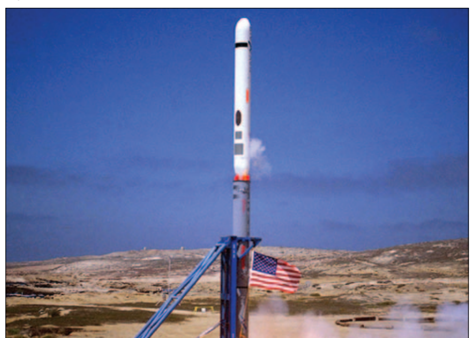
Figure 20: Tomahawk Cruise Missile

The Tomahawk Cruise Missile is a long-range, subsonic cruise missile used for land attack warfare, and is launched from surface ships and submarines. The current inventory is 1,474 missiles, with an average age of 11.88 years and a 30-year service life. During Operation Iraqi Freedom, 788 Tomahawk's were expended. The follow-on Tactical Tomahawk (TACTOM) is scheduled to enter the inventory in 2005.