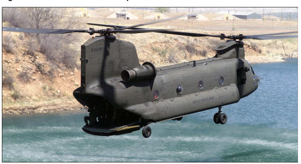
Figure 4: CH-47D/F Chinook Helicopter

The CH-47 helicopter is a twin-engine, tandem rotor helicopter designed for transportation of cargo, troops, and weapons. The Army inventory consists of 426 CH-47D models and 2 CH-47F models. The CH-47F Improved Cargo Helicopter is a remanufactured version of the CH-47D and includes a new digital cockpit and a modified airframe to reduce vibration. The overall average age of the CH-47 is 14 years old. The Army plans to convert 76 D model aircraft to the F model between fiscal years 2005 and fiscal year 2009.