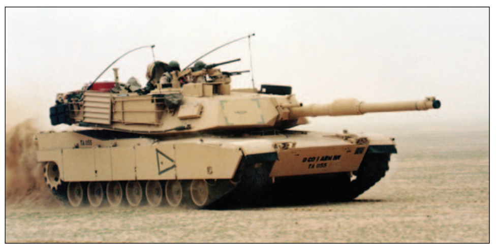
Figure 1: Abrams Tank