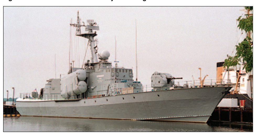
Figure 15: FFG-7 Oliver Hazard Perry Class Frigate

Navy FFG-7 Frigates are surface combatants with anti-submarine warfare (ASW) and anti-air warfare (AAW) capabilities. Frigates conduct escort for amphibious expeditionary forces, protection of shipping, maritime interdiction, and homeland defense missions. There are 32 FFGs in the fleet, with 30 programmed for modernization. The average age of the fleet is 19 years. The FFGs are expected to remain in the fleet until 2020.