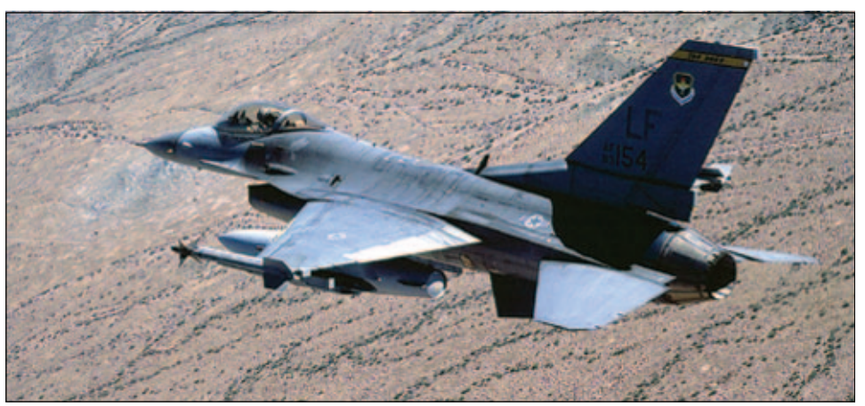
Figure 8: F-16 Fighting Falcon Aircraft