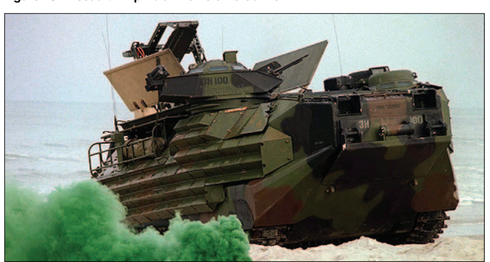
Figure 23: Assault Amphibian Vehicle-Personnel

The AAV is an armored, fully-tracked landing vehicle that carries troops in water operations from ship to shore through rough water and surf zone, or to inland objectives ashore. There are 1,057 vehicles in the inventory. The Marine Corps plans to replace the AAV with the Expeditionary Fighting Vehicle (formerly the AAAV—Advanced Amphibious Assault Vehicle).