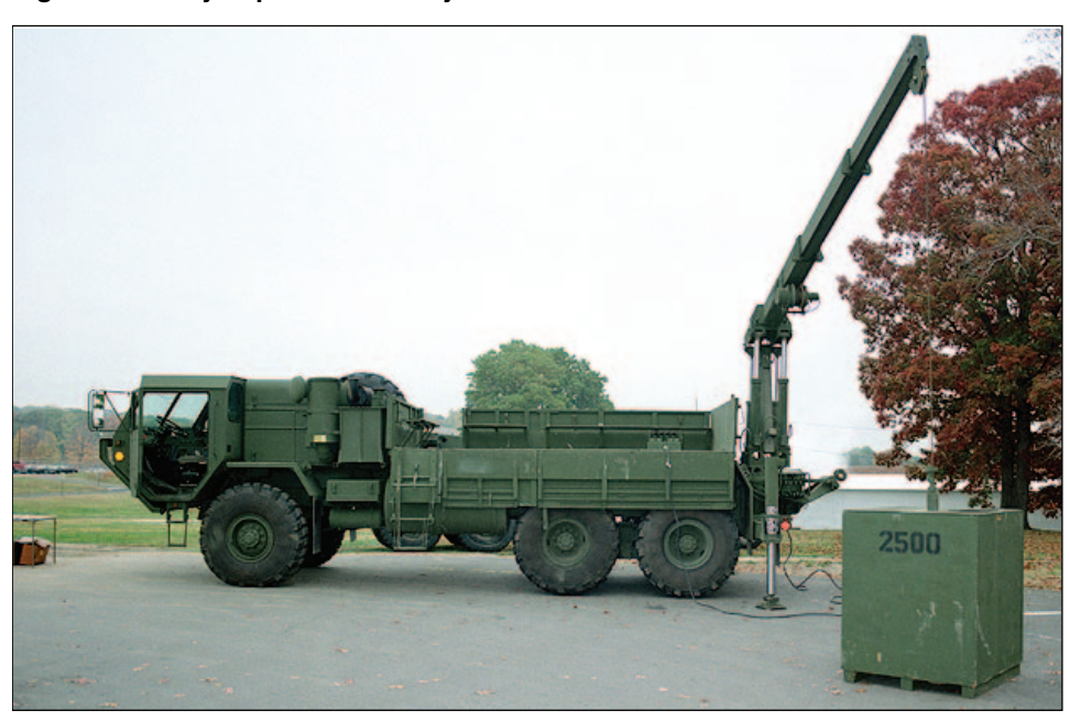
Figure 5: Heavy Expanded Mobility Tactical Truck

The HEMTT provides transport capabilities for re-supply of combat vehicles and weapon systems. The HEMTT's five basic configurations include the cargo truck, the load handling system, wrecker, tanker, and tractor. The HEMTT entered into the Army's inventory in 1982. The current inventory totals about 12,500 and the average age is 13 years.