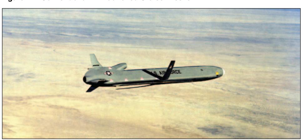
Figure 12: Conventional Air Launched Cruise Missile

The CALCM is an accurate long-range standoff weapon with an adverse weather, day/night, and air-to-surface capability. It employs a global positioning system coupled with an inertial navigation system. It was developed to improve the effectiveness of the B-52 bombers and became operational in January 1991. Since initial deployment, an upgraded avionics package, including a larger conventional payload and a multi-channel global positioning system receiver, has been added on all of the missiles. The CALCM total inventory is about 478, and the average age is about 15 years.