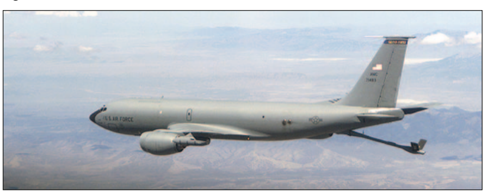
Figure 11: KC-135 Stratotanker Aircraft

The KC-135 is one of the oldest airframes in the Air Force's inventory, and represents 90 percent of the tanker fleet. Its primary mission is air refueling, and it supports Air Force, Navy, Marine Corps, and allied aircraft. The first KC-135 was delivered in June 1957. The original A models have been re-engined, modified, and designated as E, R, or T models. The E models are located in the Air Force Reserve and Air National Guard. The total inventory of the KC-135 aircraft is 543, and the average age is about 43 years.