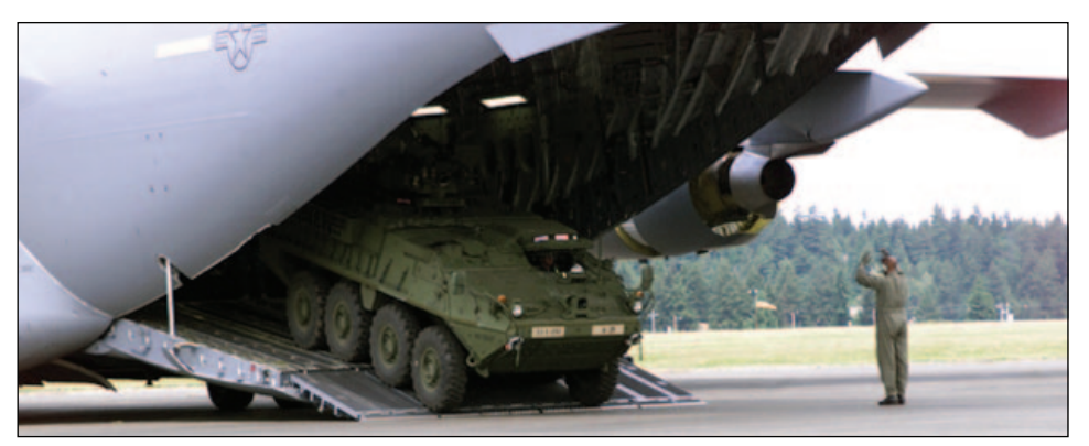
Figure 3: Stryker