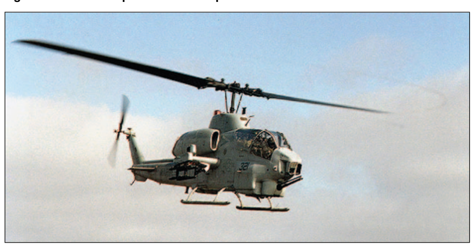
Figure 21: AH-1W Super Cobra Helicopter

The AH-1W Super Cobra provides en route escort and protection of troop assault helicopters, landing zone preparation immediately prior to the arrival of assault helicopters, landing zone fire suppression during the assault phase, and fire support during ground escort operations. There are 193 aircraft in the inventory with an average age of 12.6 years.