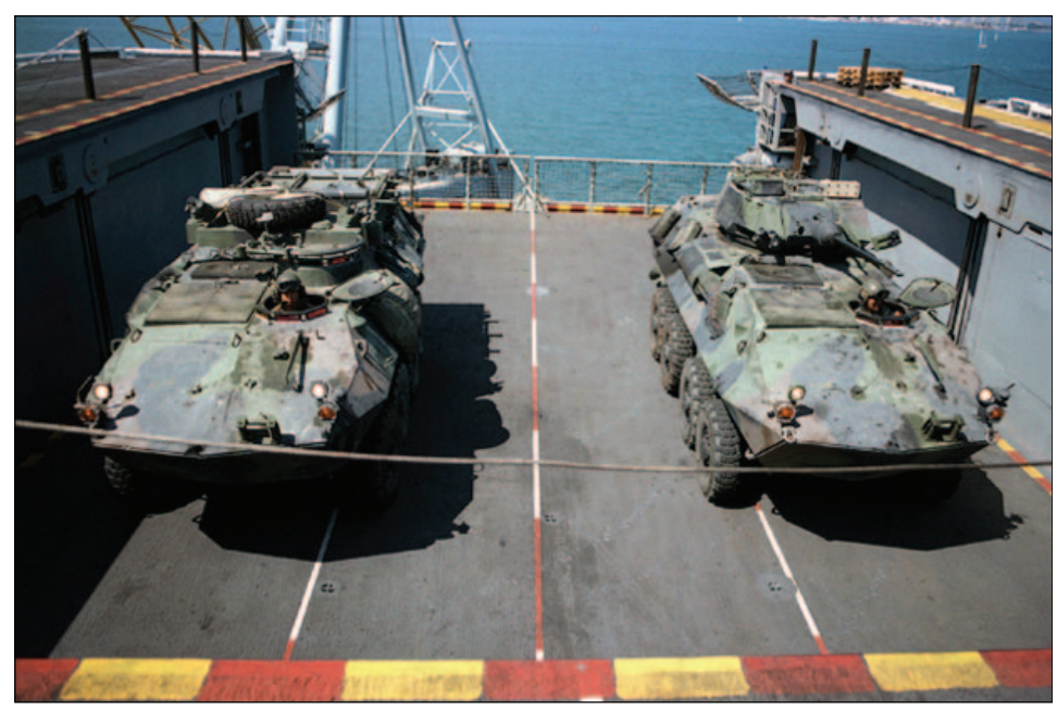
Figure 24: Light Armored Vehicle-Command & Control

The LAV-C2 variant is a mobile command station providing field commanders with the communication resources to command and control Light Armored Reconnaissance (LAR) units. It is an all-terrain, all-weather vehicle with night capabilities and can be made fully amphibious within three minutes. There are 50 vehicles in the inventory with an average age of 14 years.