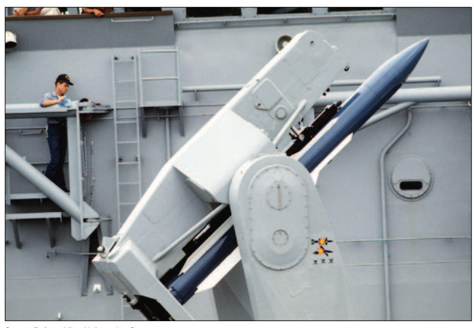
Figure 19: Standard Missile-2 Surface-to-Air Missile

The Standard Missile-2 (SM-2) is a medium to long-range, shipboard surface- to-air missile with the primary mission of fleet area air defense and ship self-defense, and a secondary mission of anti-surface ship warfare. The Navy is currently procuring only the Block IIIB version of this missile. While the actual number in the inventory is classified, the Navy plans to procure 825 Block IIIB missiles between fiscal years 1997 and 2007. Currently, 88 percent of the inventory is older than 9 years. A qualitative evaluation program adjusted the initial 10-year service life out to 15 years.