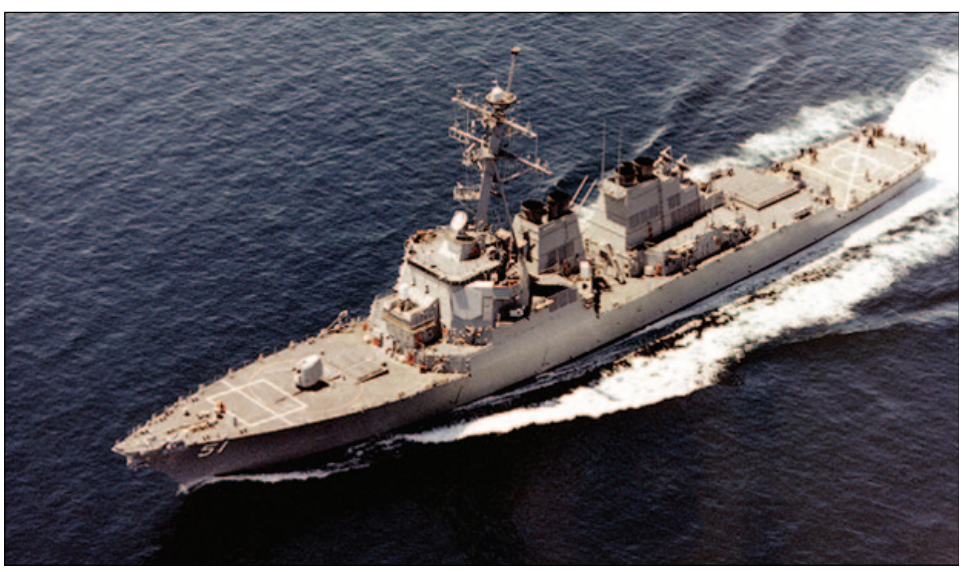
Figure 14: DDG-51 Arleigh Burke Class Destroyer

Navy Destroyers are multi-mission combatants that operate offensively and defensively, independently, or as part of carrier battle groups, surface action groups, and in support of Marine amphibious task forces. This is a 62-ship construction program, with 39 in the fleet as of 2003. The average age of the ships is 5.8 years, with the Arleigh Burke (DDG-51) coming into service in 1991. The follow-on program is the DD(X), with initial construction funding in 2005 and delivery beginning 2011.