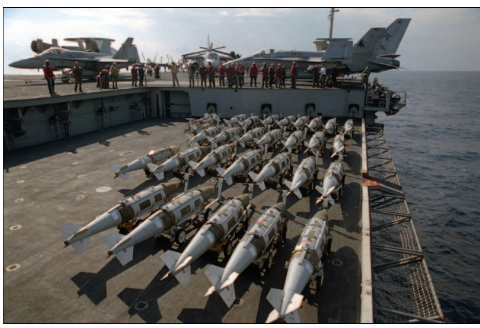
Figure 13: Joint Direct Attack Munition

The Joint Direct Attack Munition is a guidance tail kit that converts existing unguided bombs into accurate, all-weather "smart" munitions. This is a joint Air Force and Navy program to upgrade the existing inventory of 2,000 and 1,000-pound general-purpose bombs by integrating them with a guidance kit consisting of a global positioning system-aided inertial navigation system. In its most accurate mode, the system will provide a weapon circular error probable of 13 meters or less. The JDAM first entered the inventory in 1998. The total projected inventory of the JDAM is about 92,679, and the current average age is less than 5 years. Future upgrades will provide a 3-meter precision and improved anti-jamming capability.