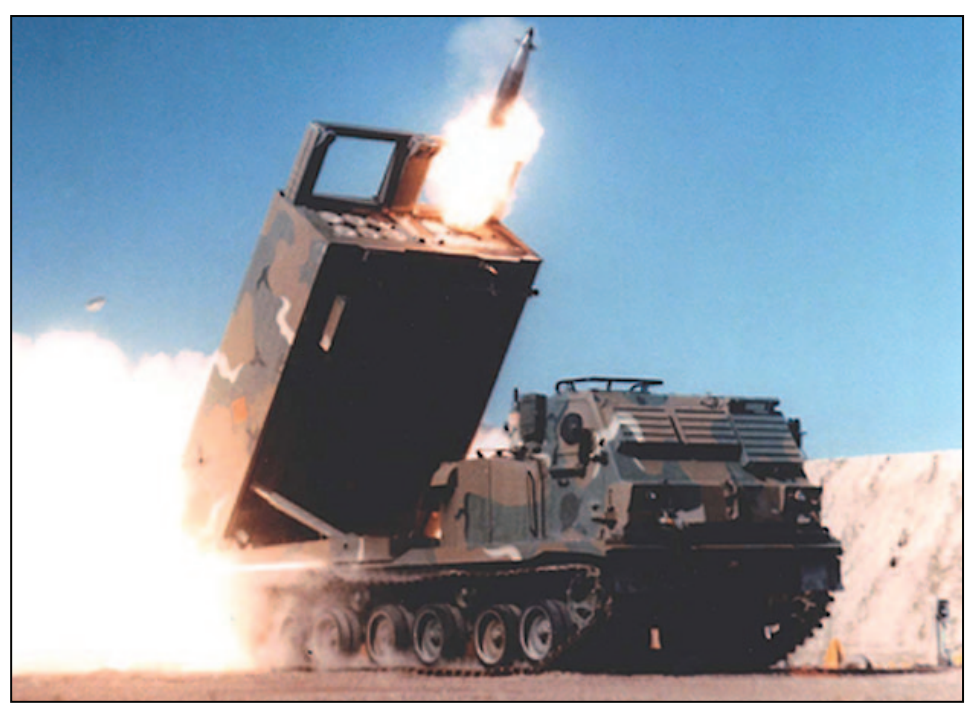
Figure 7: Guided Multiple Launch Rocket System

The Guided Multiple Launch Rocket System Dual Purpose Improved Convention Munition (GMLRS-DPICM) is an essential component of the Army's transformation. It upgrades the M26 series MLRS rocket and is expected to serve as the baseline for all future Objective Force rocket munitions. The Army plans to procure a total of 140,004 GMLRS rockets. There are currently no GMLRS rockets in inventory, but it was approved in March 2003 to enter low rate initial production to produce 108 missiles.