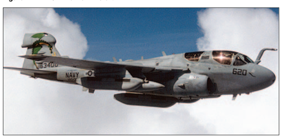
Figure 17: EA-6B Prowler Aircraft

The EA-6B is an integrated electronic warfare aircraft system combining long-range, all-weather capabilities with advanced electronic countermeasures. Its primary mission is to support strike aircraft and ground troops by jamming enemy radar, data links, and communications. The current inventory is 121 with an average age of 20.7 years. The follow-on aircraft is the E/A-18G Growler Airborne Electronic Attack aircraft, a variant of the F/A-18 E/F.