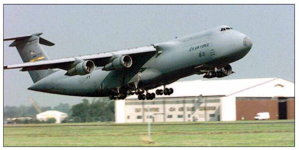
Figure 10: C-5 Galaxy Transport Aircraft

The C-5 Galaxy is the largest of the Air Force's air transport aircraft, and one of the world's largest aircraft. It can carry large cargo items over intercontinental ranges at jet speeds and can take off and land in relatively short distances. It provides a unique capability in that it is the only aircraft that can carry certain Army weapon systems, main battle tanks, infantry vehicles, or helicopters. The C-5 can carry any piece of army combat equipment, including a 74-ton mobile bridge. With aerial refueling, the aircraft's range is limited only by crew endurance. The first C-5A was delivered in 1969. The Air Force currently has 126 C-5 aircraft in its inventory, and the average age is about 26 years.