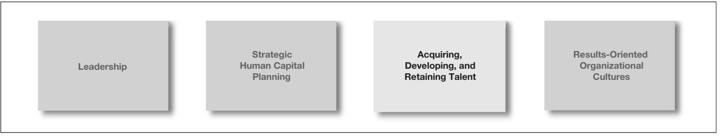
Figure 1: Cornerstones of GAO's Model of Strategic Human Capital Management

Strategic human capital management centers on viewing people as assets whose value to an organization can be enhanced through investment. Like many organizations, federal agencies are trying to determine how best to manage their human capital in the face of significant and ongoing change. GAO's model of strategic human capital management<sup>1</sup> identified four cornerstones of serious change management initiatives. These cornerstones represent strategic human capital management challenges that, if not addressed, can undermine agency effectiveness. One of these challenges is for the federal government to successfully acquire, develop, and retain talent. (See fig. 1.) Investing in and enhancing the value of employees through training and development is a crucial part of addressing this challenge.