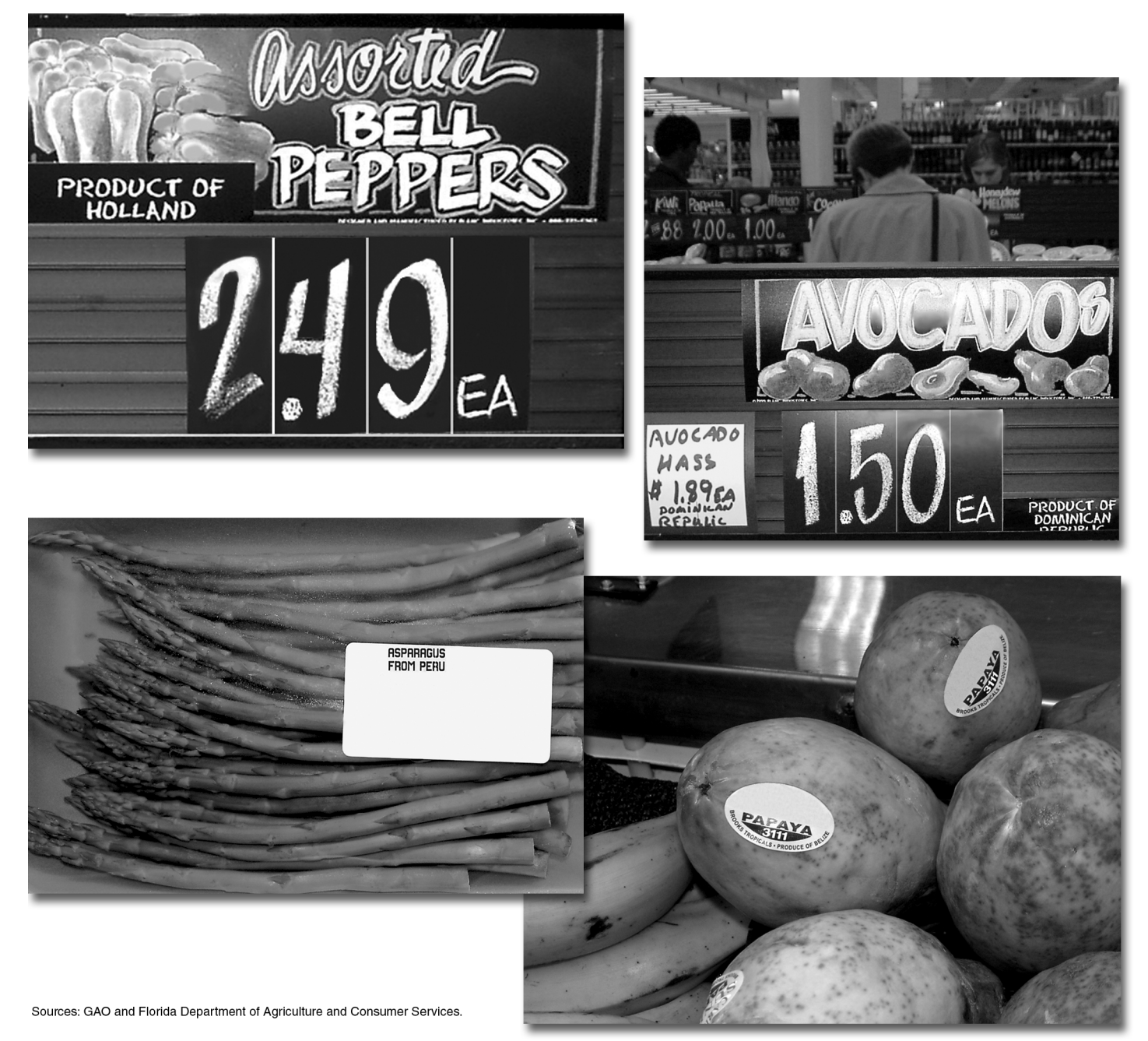
Figure 1: Examples of Labels on Imported Produce in Florida Grocery Stores