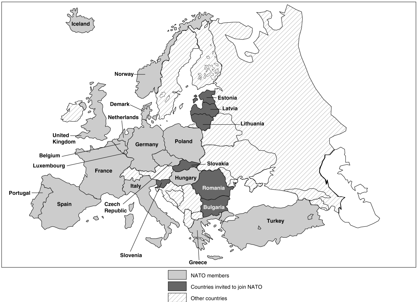
Figure 1: Countries Invited to Join NATO and Current European NATO Members