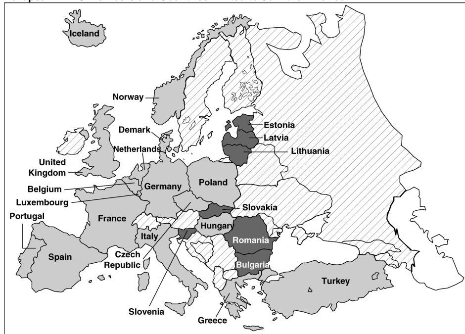
European NATO Members and Countries Invited to Join the Alliance

NATO members Countries invited to join NATO Other countries