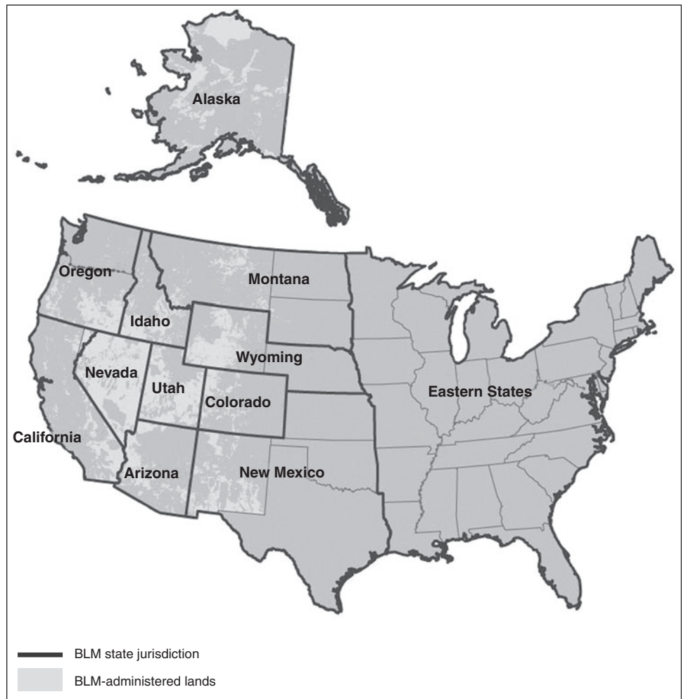
Figure 2: BLM-Administered Lands and State Jurisdictions