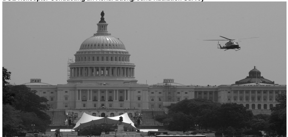
DOE Helicopter Conducting an Aerial Background Radiation Survey

DOE's two Remote Sensing Laboratories are protected at the lowest level of physical security allowed by DOE guidance because, according to DOE, capabilities and assets to prevent and respond to nuclear and radiological emergencies have been dispersed across the country and are not concentrated at the laboratories. However, we found a number of critical capabilities and assets that exist only at the Remote Sensing Laboratories and whose loss would significantly hamper DOE's ability to quickly prevent and respond to a nuclear or radiological emergency. These capabilities include the most highly trained teams for minimizing the consequences of a nuclear or radiological attack and the only helicopters and planes that can readily help locate nuclear or radiological devices or measure contamination levels after a radiological attack. Because these capabilities and assets have not been fully dispersed, current physical security measures may not be sufficient for protecting the facilities against a terrorist attack.