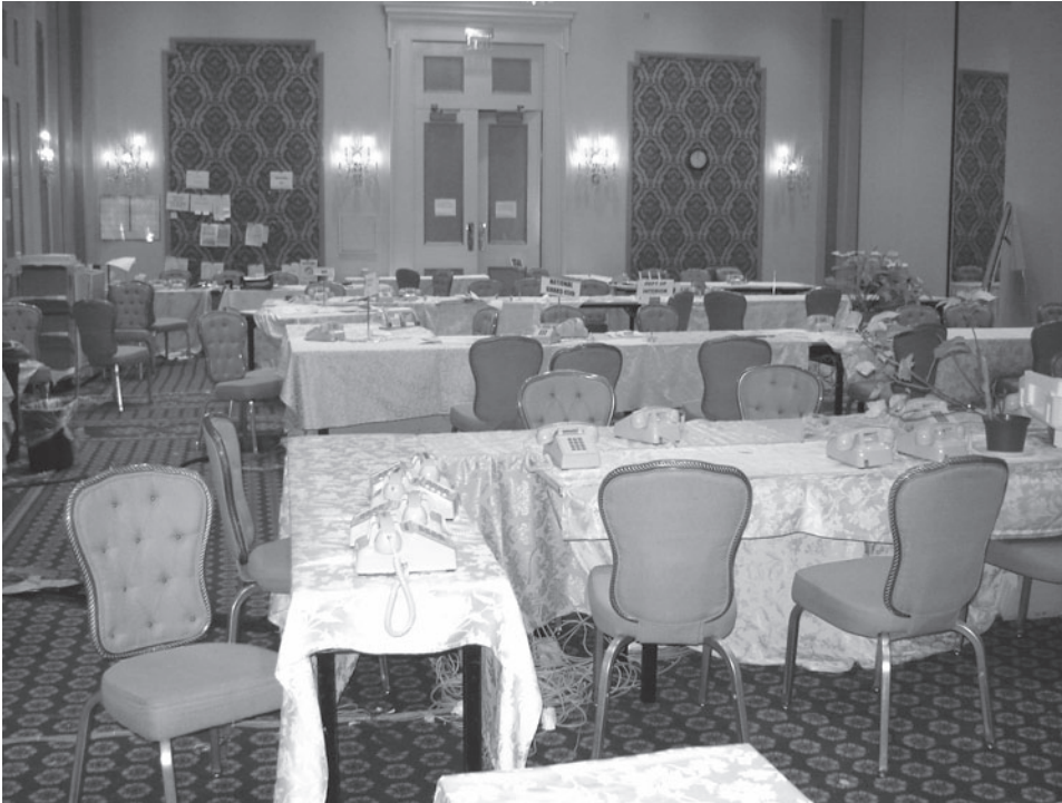
Figure 1. Hotel Conference Room Where FEMA Laptops and Printers Were Supposed to Be