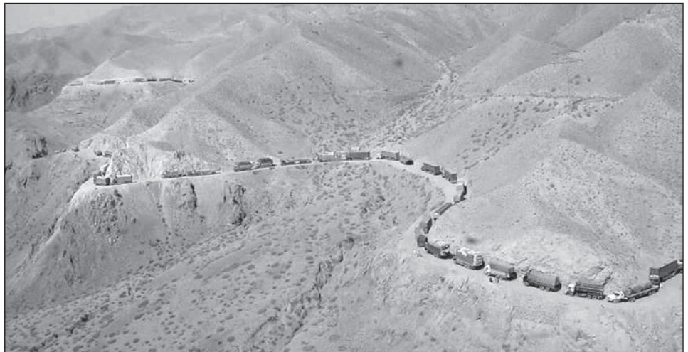
Figure 1: Three-Mile Backup of Fuel Delivery Trucks and Other Supply Vehicles Inside Afghanistan along the Northern Passage from Pakistan (February 2007)

Fuel presents an enormous logistical burden for DOD when planning and conducting military combat operations. For current operations, the fuel logistics infrastructure requires, among other things, long truck convoys that move fuel to forward-deployed locations while exposed to the vulnerabilities of operations, such as enemy attacks (see figs. 1 and 2). Army officials have estimated that about 70 percent of the tonnage required to position its forces for battle consists of fuel and water. An armored division can use 600,000 gallons of fuel a day, and an air assault division can use 300,000 gallons a day. In addition, combat support units consume more than half of the fuel the Army uses on the battlefield. Aircraft also burn through fuel at rapid rates; a B-52H, for example, burns approximately 3,500 gallons per flight hour. Of the four military services, the Air Force consumes the greatest amount of petroleum-based fuels.