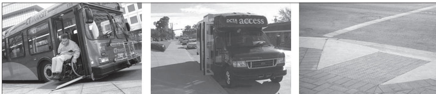
Figure 1: Examples of Accessible Transportation Features