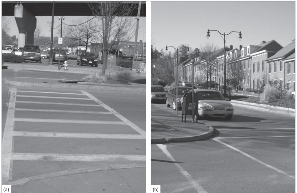
Figure 3: Inaccessible Sidewalks and Medians in a Downtown Area