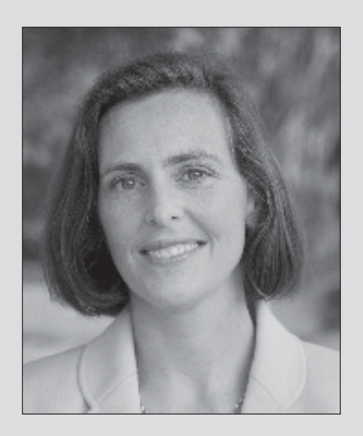
Democrat — 11