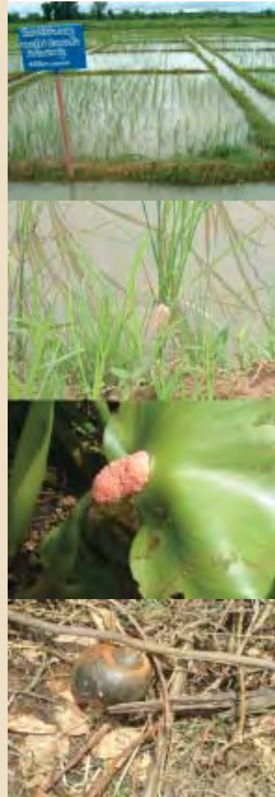
Rice paddy attacked by GAS, rice stalks with eggs, eggs on water hyacinth, GAS shell.