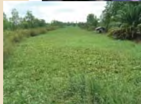
Canal in Thailand covered with water hyacinth, detail of flower. (A.Gutiérrez)