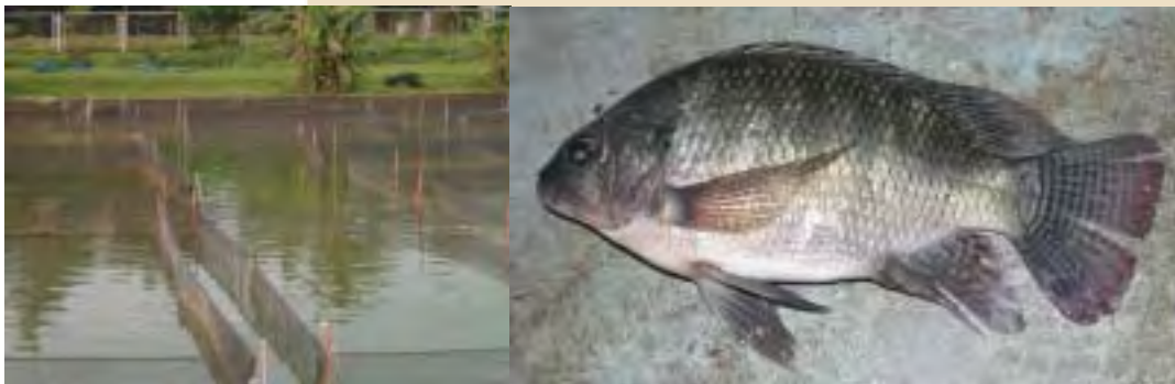
Tilapia aquaculture pond in Philippines, tilapia specimen.

Some development agencies have begun to recognize the links between development projects and IAS. For example, USAID has sponsored this assessment to better understand the linkage between development projects and IAS in the freshwater systems of Southeast Asia; the Swedish International Development Cooperation Agency has sponsored a study on the role of alien species in aquaculture in the Mekong.