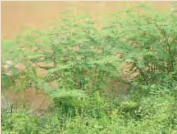
Mimosa pigra . (A. Gutiérrez)

As economic development and integration progress in Southeast Asia, the increased trade flows and sectoral development, especially hydroelectric, will face new challenges from IAS. Development agencies need to work with national governments, industry, and non-governmental organizations to build IAS prevention policies and practices into future agreements and projects. Recommendations for how development agencies can contribute to addressing IAS in Southeast Asia are listed in the Summary of Recommendations.