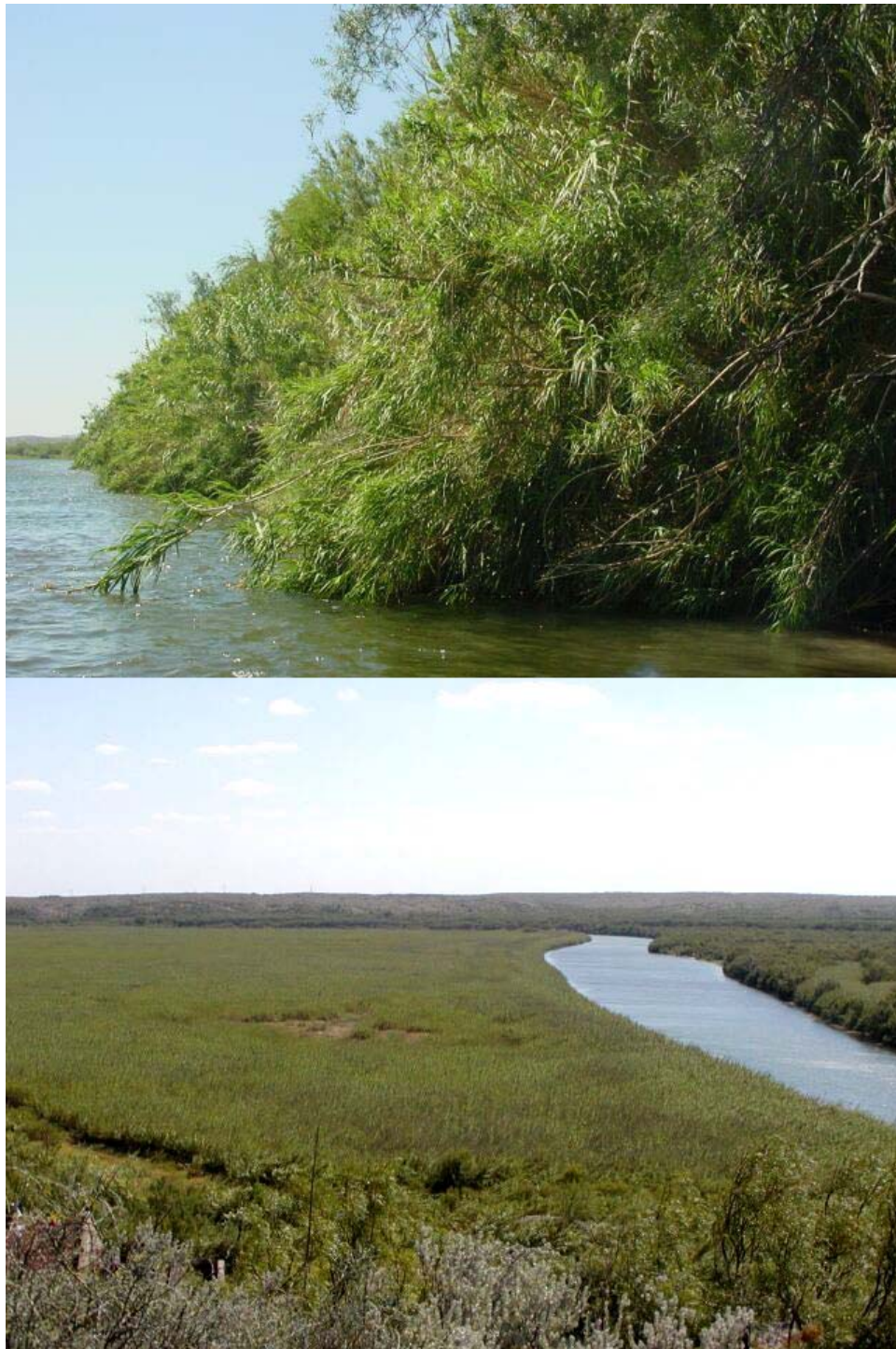
Figure 5. Photographs showing extensive infestations of giant cane along the Rio Grande (upper photograph is located near Del Rio, TX; lower photograph is located near the Maverick Irrigation District)