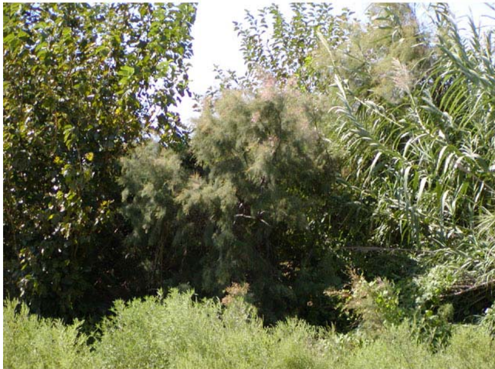
Figure 9. Tamarisk spp. located along the banks of the Rio Grande