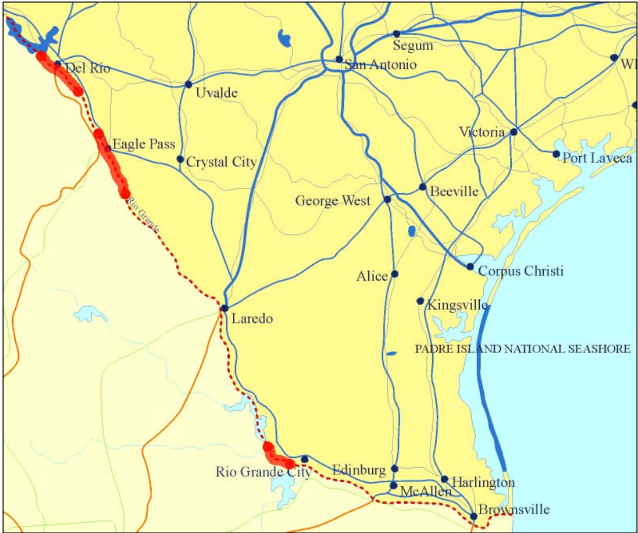
Figure 1. Map showing all the areas surveyed on the Rio Grande by boat