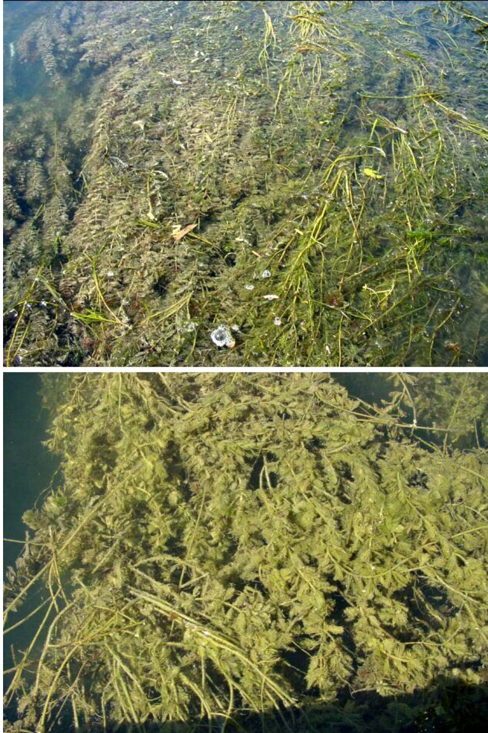
Figure 8. Close-ups of Eurasian watermilfoil from the Rio Grande