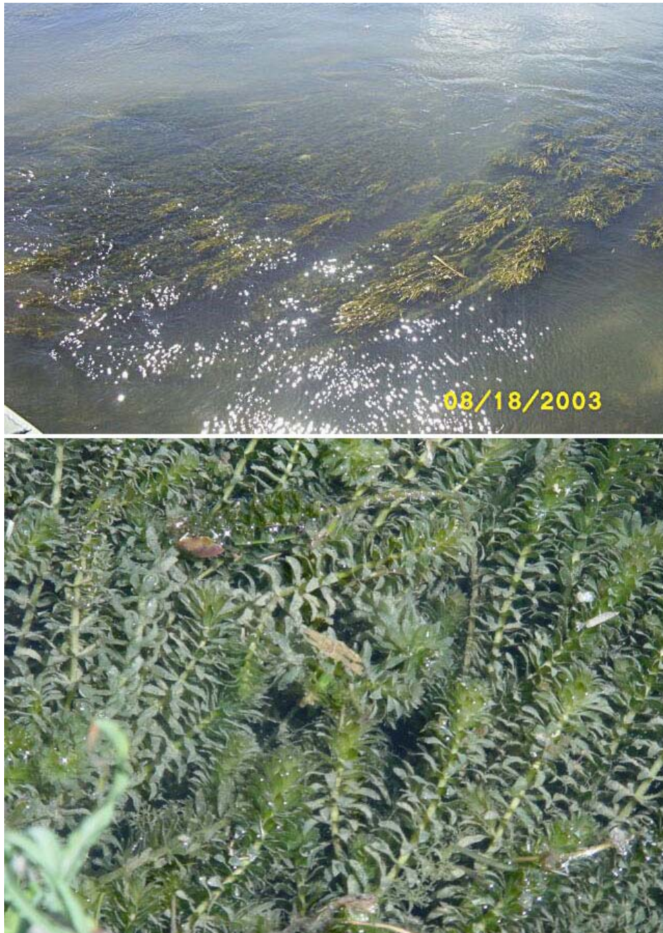
Figure 4. Hydrilla intermixed with water stargrass (top) and close-up of hydrilla on Rio Grande

While one of the main objectives of the 2003 survey was to locate hydrilla infestations, several additional introduced and potentially damaging plant species were observed. These included giant cane ( Arundo donax ) (Figure 5), elephant-ear ( Colocasia esculenta ) (Figure 6), Eurasian watermilfoil ( Myriophyllum spicatum ) (Figures 7 and 8), parrotfeather ( M. aquaticum ), and salt cedar ( Tamarisk spp.) (Figure 9). According to data collected during the 2001 (Nibling and Grodowitz 2001) and 2003 surveys, extensive stands of giant cane are now