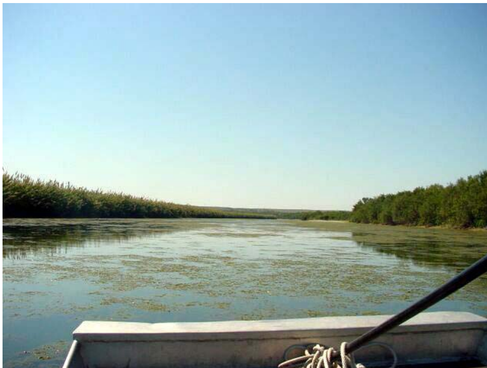
Figure 7. Eurasian watermilfoil mat covering the entire river from shore to shore above the Maverick Irrigation District dam