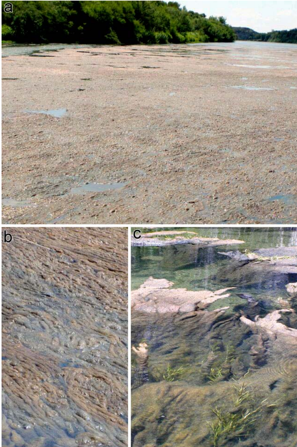
Figure 11. Black moss infestation along the lower Rio Grande below Roma, TX (a. Large population view showing infestation crossing entire river, b. Close-up of infestation, c. Black moss covering and impacting submersed aquatic plants)