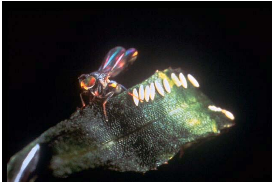
Figure 3. Hydrellia pakistanae female with eggs on leaf of hydrilla