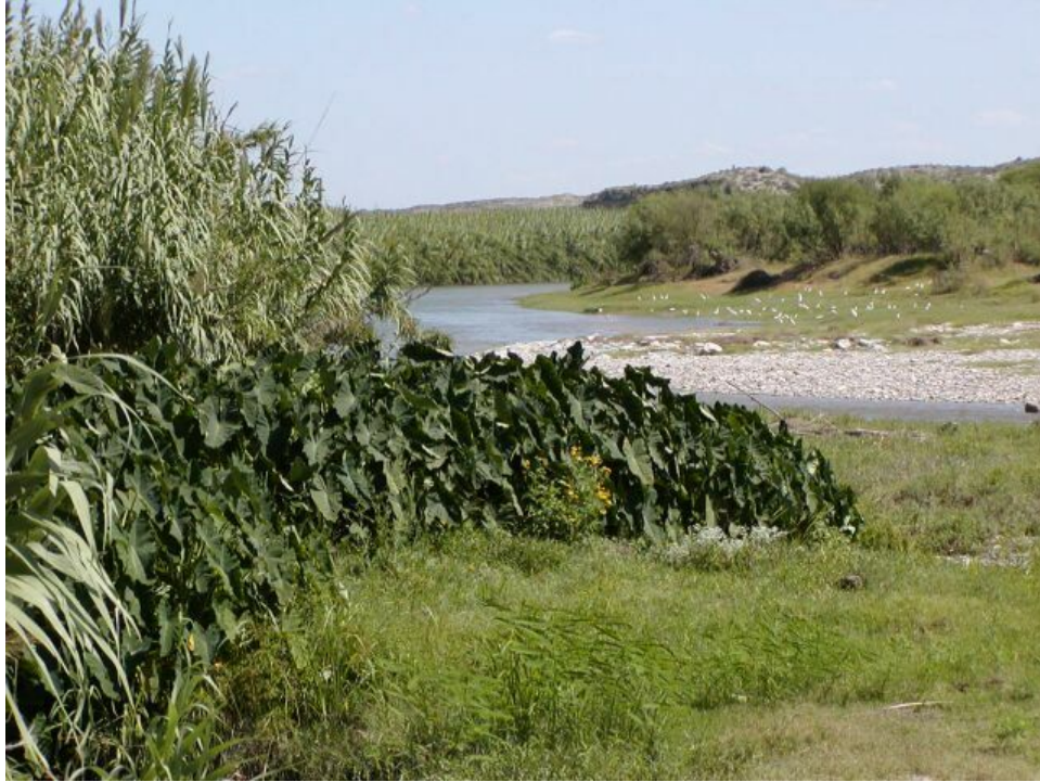
Figure 6. Elephant-ear was found commonly along many stretches of the river from Eagle Pass to Del Rio