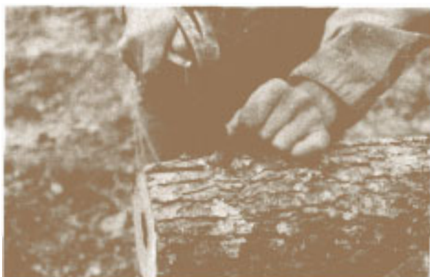
Figure 4. Dowels are pounded into the holes with a hammer.