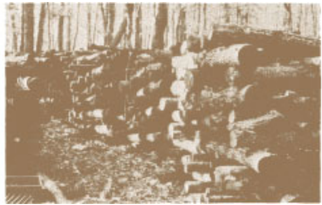
Figure 6. Crib stacking system.

off. Small electric deep-fat fryers or camp stoves may be used to heat the wax. In either case, use extreme caution to prevent fire; keep a fire extinguisher close at hand. Hot wax may be applied to the filled holes with special wax applicators, which look like kitchen turkey basters, or with a brush (Figure 5). Be sure to use a natural hair brush because most synthetic brushes will melt in the hot wax.