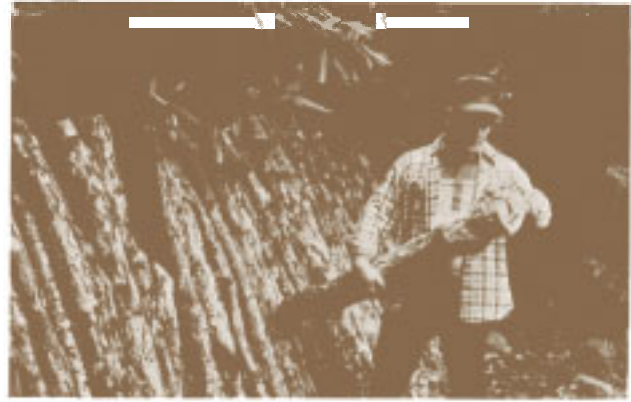
Figure 7. Lean-to stacking system.

To calculate the dry weight of each of the reference logs, multiply the fresh weight of the log by 1 minus the