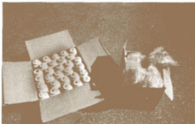
Figure 1. Shiitake spawn is available in sawdust (left) or on wooden dowels (right).