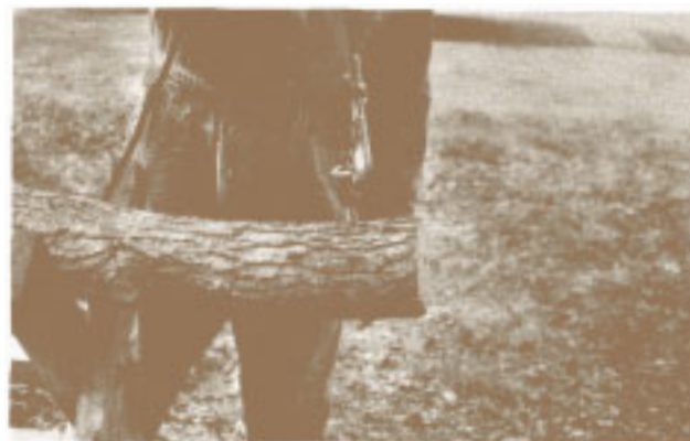
Figure 2. Holes are drilled in the log with a high-speed drill.