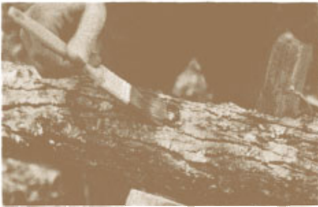
Figure 5. Holes filled with spawn are sealed with hot wax.