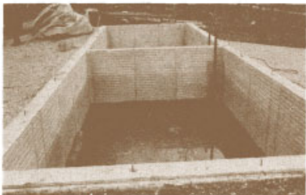
Figure 8. Structure for soaking logs.