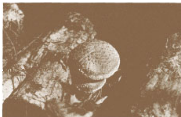
Figure 9. Mushrooms ready for harvest.