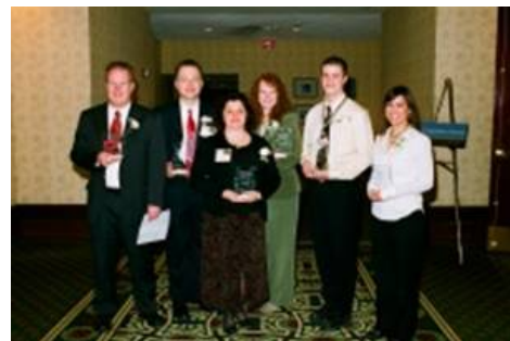
2006 and 2007 Governor's Award for Volunteer Service Recipients