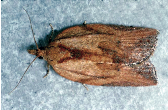
Adult Epiphyas postvittana (male)

Image P1030 Copyright © Malcolm Storey, 2005, www.bioimages.org.uk . All rights reserved.