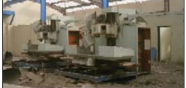
Tuwaiitha Tools Workshop—stripped Chen Ho Machine Tools.