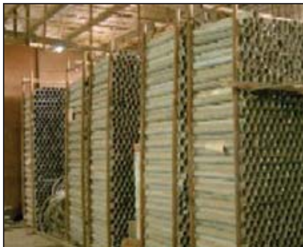
81-mm aluminum tubes in a second Dhu al-Fiqr Factory warehouse.

pieces might have been disassembled for valuable subassemblies such as motors and condensers. Still others could have been taken intact to preserve their function.