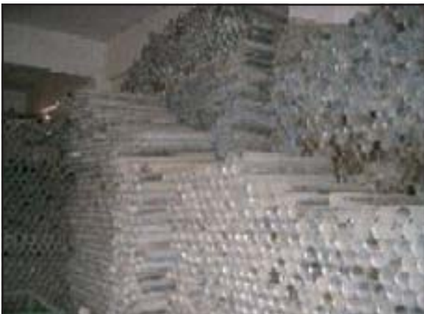
81-mm aluminum tubes in a Dhu al-Fiqr Factory warehouse.