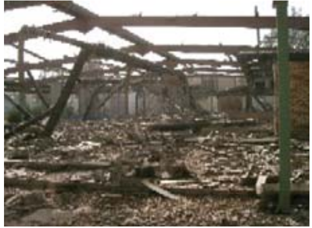
Destruction of Tuwaiitha Tools Workshop Site.