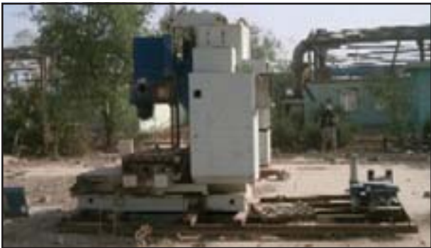
Tuwaiitha Tools Workshop—stripped Kao Fong Machine Tool.