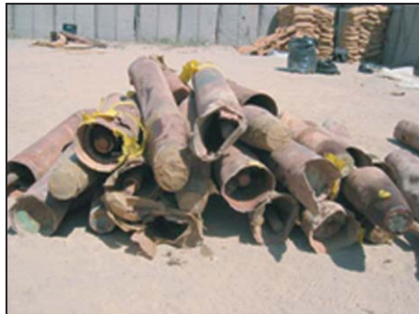
Sakr 18 Rockets