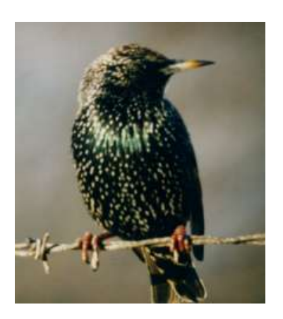
The European Starling