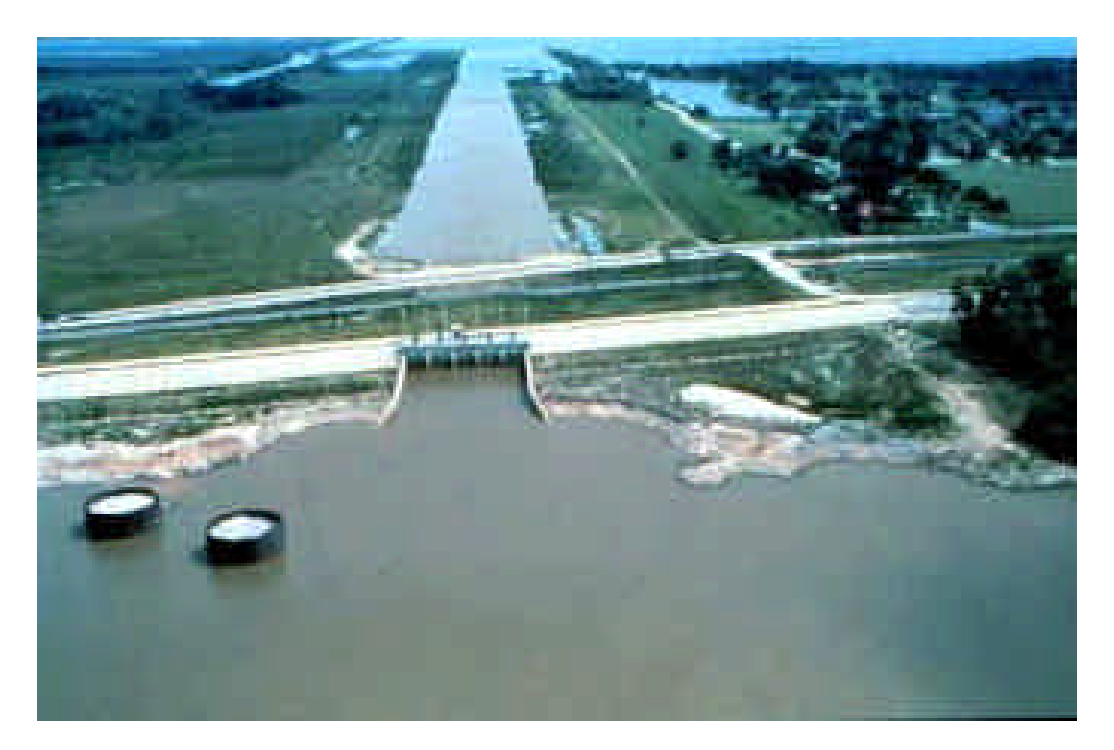
Fig. 2. The Caernarvon diversion structure

Fig. 1. Breton Sound Basin with main region of estuary influenced by diversion highlighted in gray.