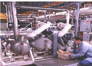
The VSV process has been successfully used to pasteurize poultry.

The entire VSV process occurs in less than one second. The first step in the VSV process is the application of a vacuum to remove air and moisture from the surface of the food. In the second step, steam is applied for a short period of time to kill off pathogenic bacteria.