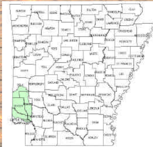
*Millwood Watershed Area