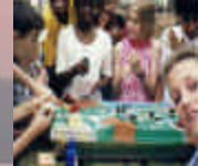
Students participating in entomology, Arkansas Wildlife, fire ant education and watershed sessions.

Students have the opportunity to attend 8 of 20 water quality educational sessions during the 2 day event. Sessions include: “Save Our Streams”, “Walk a Mile in my Moccasins”, Flood Control, Arkansas Wildlife, “Project WET”, “Project Wild”, “Project Learning Tree”, Forestry Management, Entomology, Trash Detective, Fire Ants and many more.