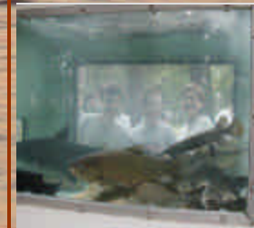
Programs represented here are AR Game & Fish, “Walk a Mile in My Moccasins”, & Biltmore Sticks.