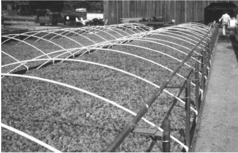
Table 5.a-1. Cell volume and number of cells per square foot for different float trays.

A University of Tennessee study found no significant differences in transplant survival or percent usable plants among plants from trays with 200, 242, 253, 288, 338 and 392 cells. However, the higher cell-number trays (those above 288) will produce a smaller-sized plant that must be clipped more often to produce a comparable-sized plant. The 242-, 253- and 288-cell trays are the most popular trays with Tennessee producers. With proper management, the 338- and 392-cell trays can also provide acceptable transplants. However, disease control may require more attention in trays with greater density of plants and restricted air circulation. Growers who still use plug-and-transfer prefer the 200-cell tray.