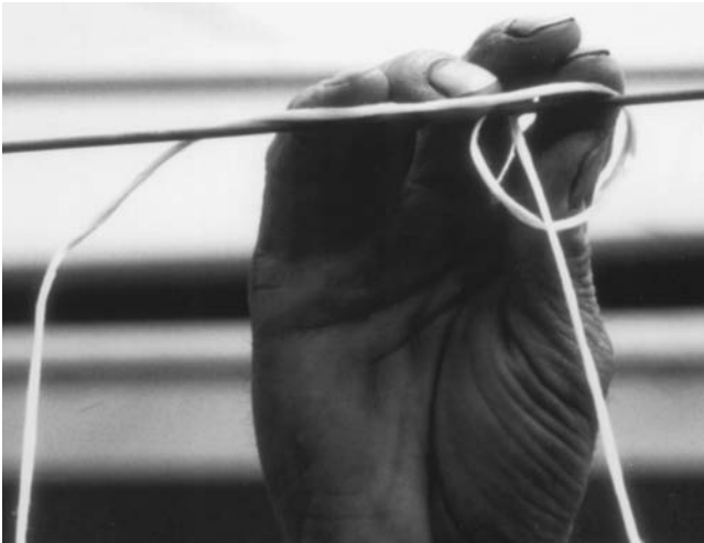
A simple slipknot is used to tie string to the plant support wire.

clockwise, continue clockwise; otherwise, when the plant gets heavy with fruit, it may slip down the string and break. Some growers prefer to use plastic clips to secure the plant to the string, either in combination with wrapping or to replace wrapping.