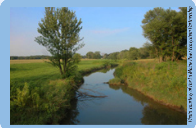
The La Moine River

2009 – Through interviews and focus groups with project leaders, determine if the proposed interventions were effective, and how the use of social indicators impacted effectiveness. Post-