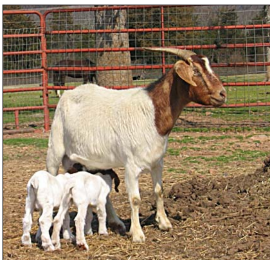
Producers must use a holistic approach to managing internal parasites.