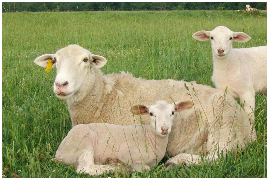
Sheep and goat producers must rely on a combination of techniques to manage internal parasites.