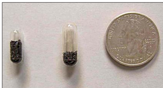
Gelatin capsules, Size 3 and Size 1, filled with 0.5 g or 500 mg of COWP.

Animals can be treated again after 4-6 weeks, if necessary. Animals should receive no more than four (if 0.5 or 1 g is used) or two (if 2 or 4 g is used) COWP boluses in a worm season. It should be noted that COWP has been found to be effective on reducing abomasal ( H. contortus ) only and not intestinal worms. COWP has been found to be effective against H. contortus in mature goats most of the time, though sometimes marginally effective. Other control strategies may be more effective in mature animals. As with all anthelmintic treatments, it is important to work with your veterinarian.