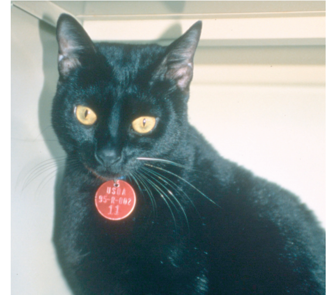
Dealers that breed animals for sale to pet stores must be in compliance with AWA regulations.

A person with a commercial business that moves animals from one location to another is considered a transporter under the AWA. Examples of transporters include airlines and trucking companies.