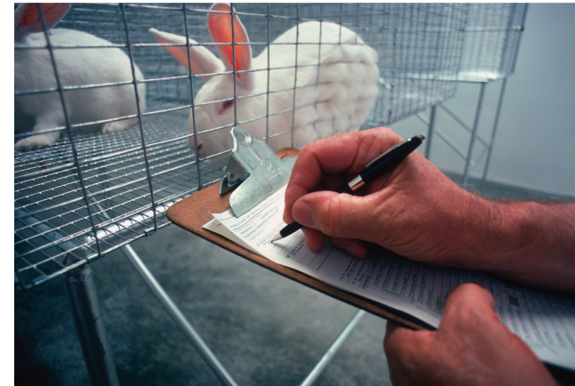
Humane care and treatment of research animals are important aspects of the AWA.

The AWA requires researchers to provide anesthesia or pain-relieving medication to minimize the pain or distress caused by the experiment, unless otherwise