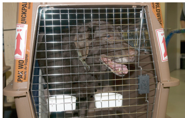
The commercial transport of animals is regulated to ensure careful handling and safe travel.

USDA is committed to its responsibilities and to meeting public expectations in enforcing the AWA. In addition to conducting routine, unannounced