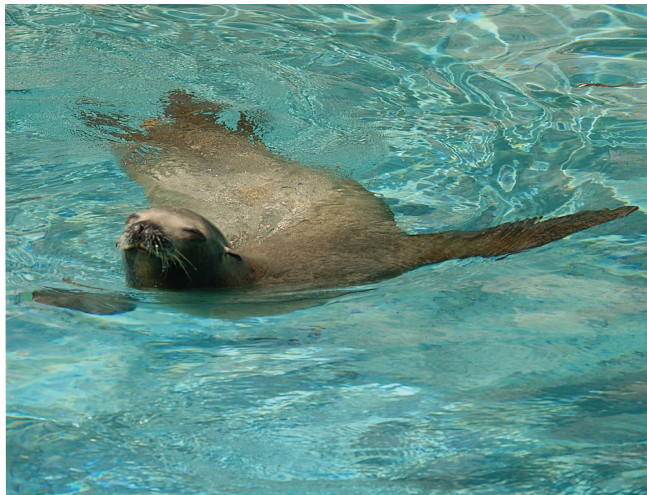
The Animal Welfare Act protects warmblooded animals used in specific activities, like this seal on display in a marine-mammals exhibit at the National Zoo.

The AWA requires that minimum standards of care and treatment be provided for certain animals bred for commercial sale, used in research, transported commercially, or exhibited to the public. Individuals who operate facilities using animals in these ways must provide their animals with adequate housing, handling, sanitation, nutrition, water, veterinary care, and protections from extreme weather and temperatures.